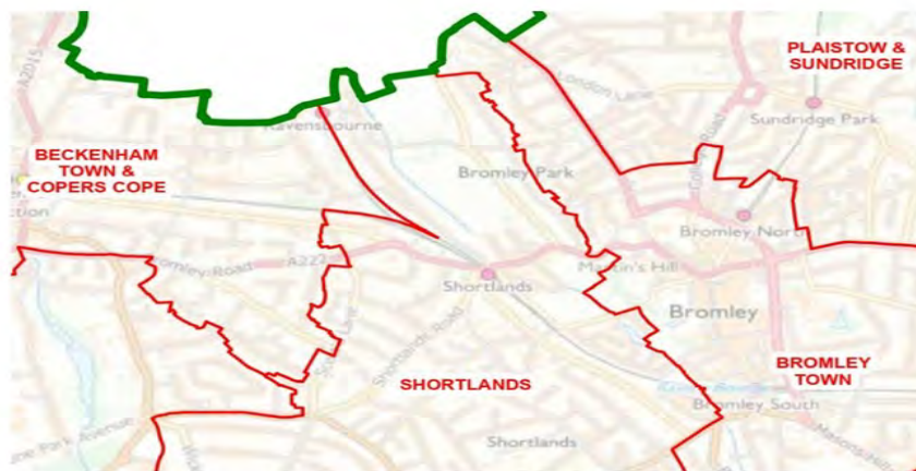
Existing Bromley Ward Boundaries:-