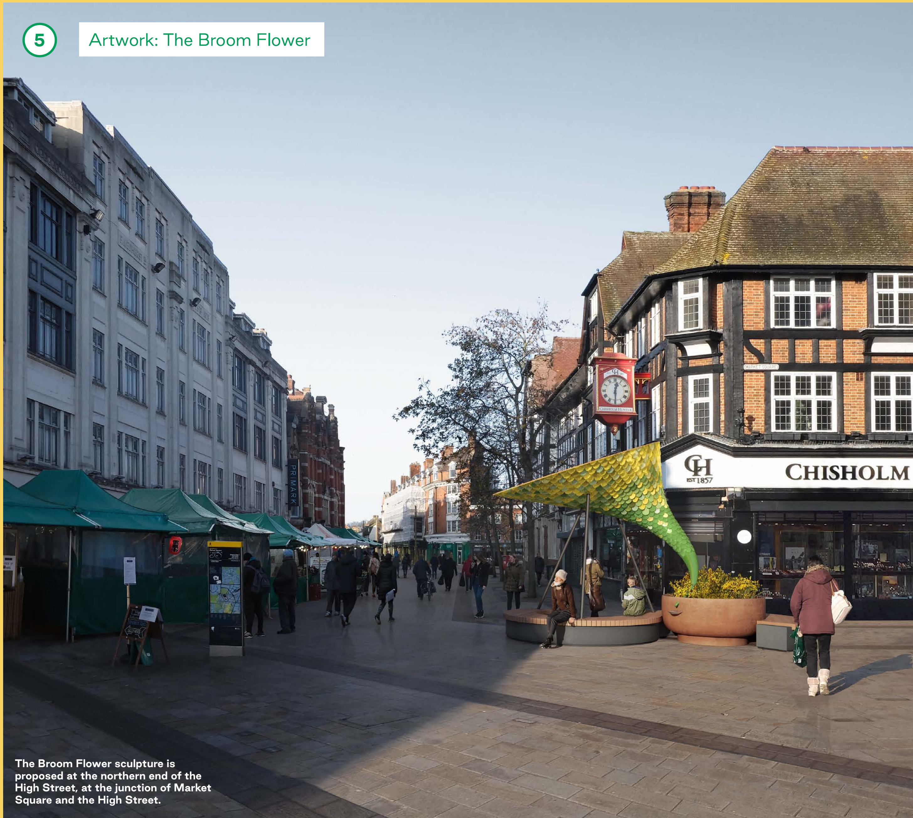
The Broom Flower sculpture is proposed at the northern end of the High Street, at the junction of Market Square and the High Street.