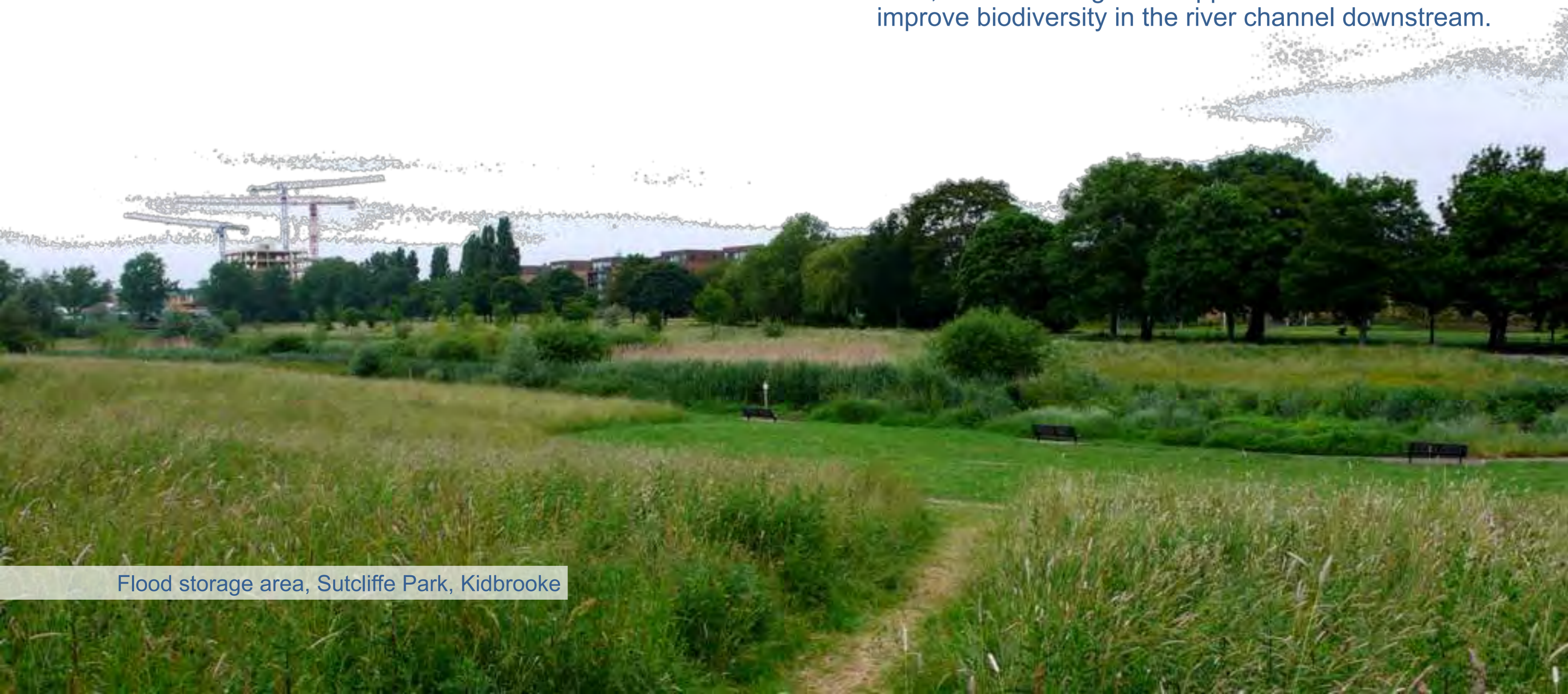
Flood storage area, Sutcliffe Park, Kidbrooke

By reducing river flood flows leaving Beckenham Place Park, there will be greater opportunities in the future to improve biodiversity in the river channel downstream.