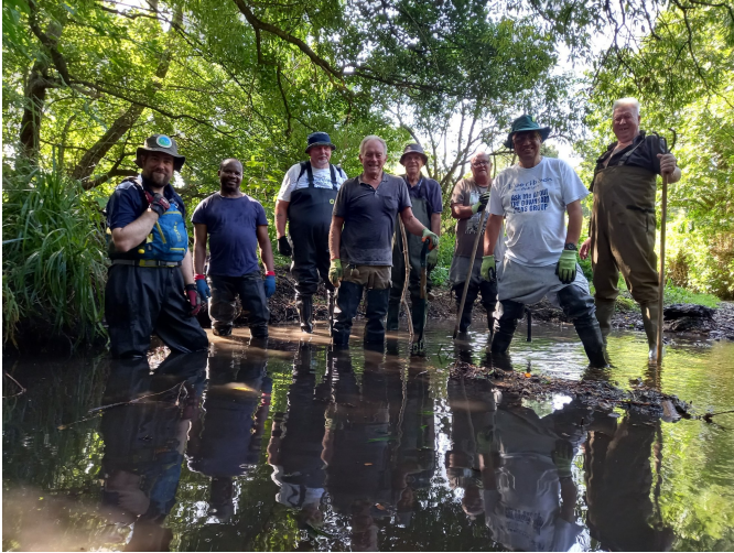
Downham Men's Group on a river work day with Thames21

Here are a couple of photographs, copied from the report: