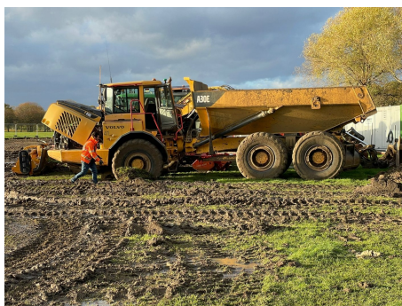
An example of the equipment in use