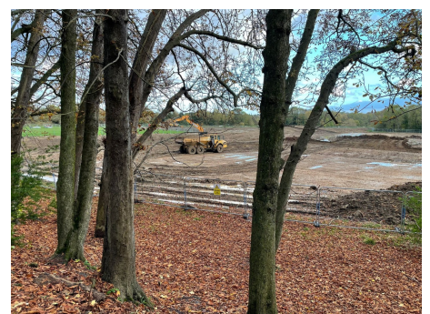
Current state of the ground clearing