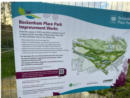
Signage detailing the plans

The report contains a link to a site where you can view updates relating to the East Side improvements and other projects. See here .