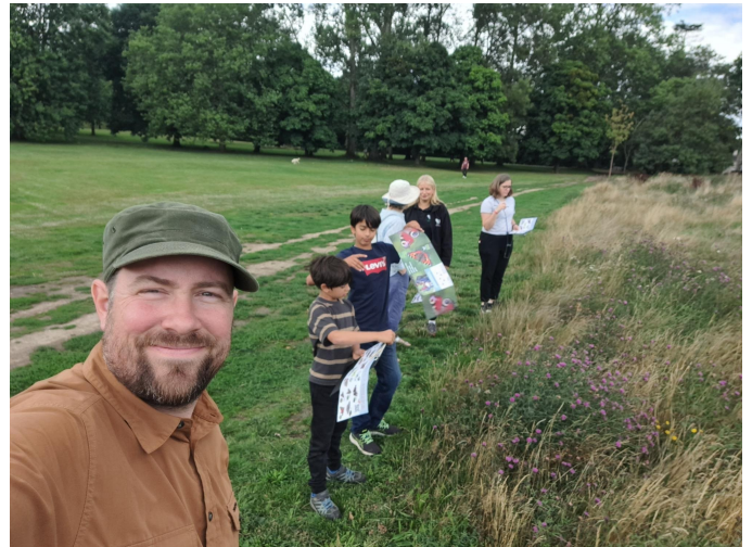
Volunteers taking part in the Big Butterfly Count

The report contains a link to a site where you can view updates relating to the East Side improvements and other projects. See here .