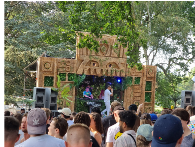
Two of the four different stages during Saturday 18th Drum'n'Bass