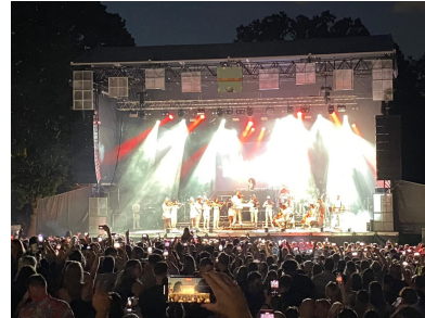
Two of the events on the main stage during Friday 17th Ibiza Classics