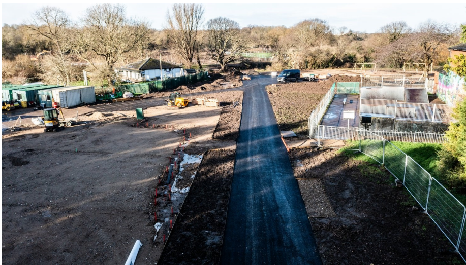
New entrance pathway and site of new multi-use games area