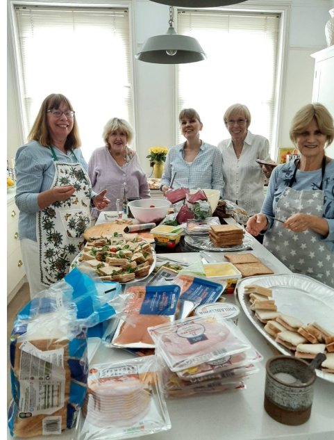
Food preparation team at work