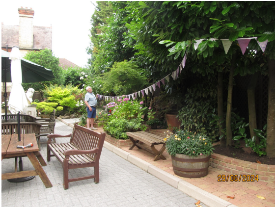
Setup duty on Saturday 29th