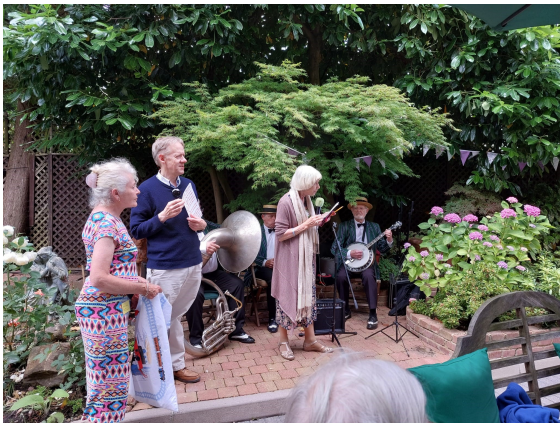
Our host addressing the guests