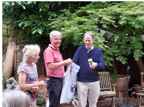
The raffle draw