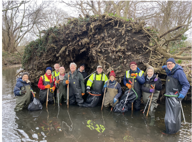
The Friends up-river testing the wading attire.

Bromley Council have reminded us, yet again, that all RVR Street Friends need to register with Bromley Council both as Street Friends and Tree Friends as we do both litter picking and basal pruning/cutting back overgrowth and thus there is an overlap. It is necessary for all Friends, and not just the co-ordinator, to be registered with the Council so they know we have received adequate training. The benefit is we are then individually covered by the borough's liability insurance which is specific for the work we do. If you are a Friend and have not yet registered, please do so here .