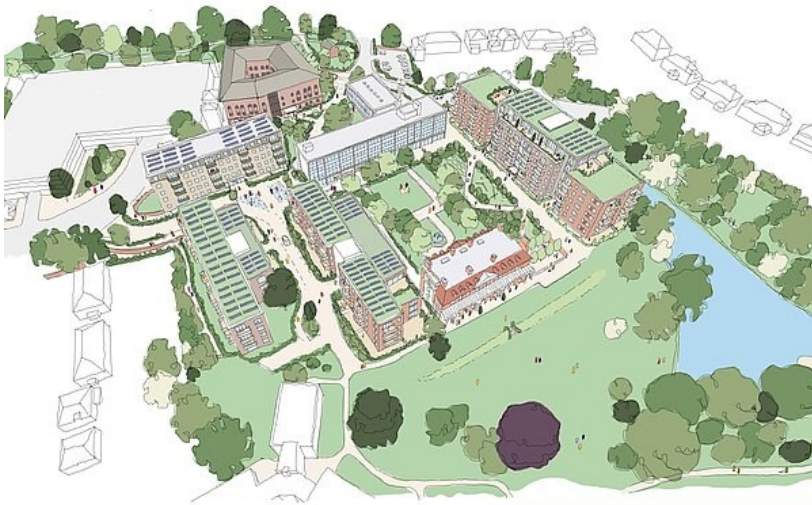
Indicative sketch of the proposed develop

Galliard, the new owners of the old Civic Centre site, approached Bromley's Planning Committee on 26th June asking approval for the redevelopment of two of the old office blocks (North Block and Stockwell) to be processed under a fast track procedure known as permitted development.