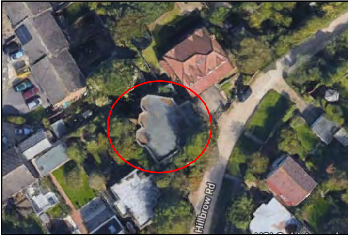
Figure 1 – Aerial photo of site.