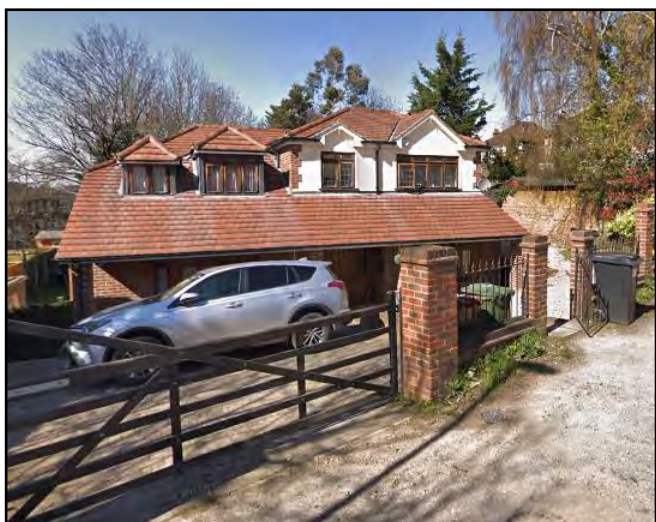
Figures 4 – 12: Eclectic mix of dwellings along Hillbrow Road.

5.11 DM Policy 31 (Alterations and extensions to existing buildings including residential extensions) states: