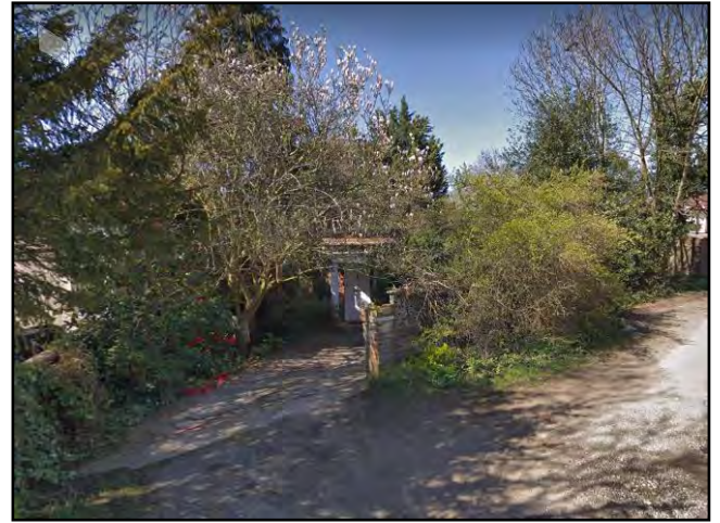
Figure 2 – View of property from Hillbrow Road.