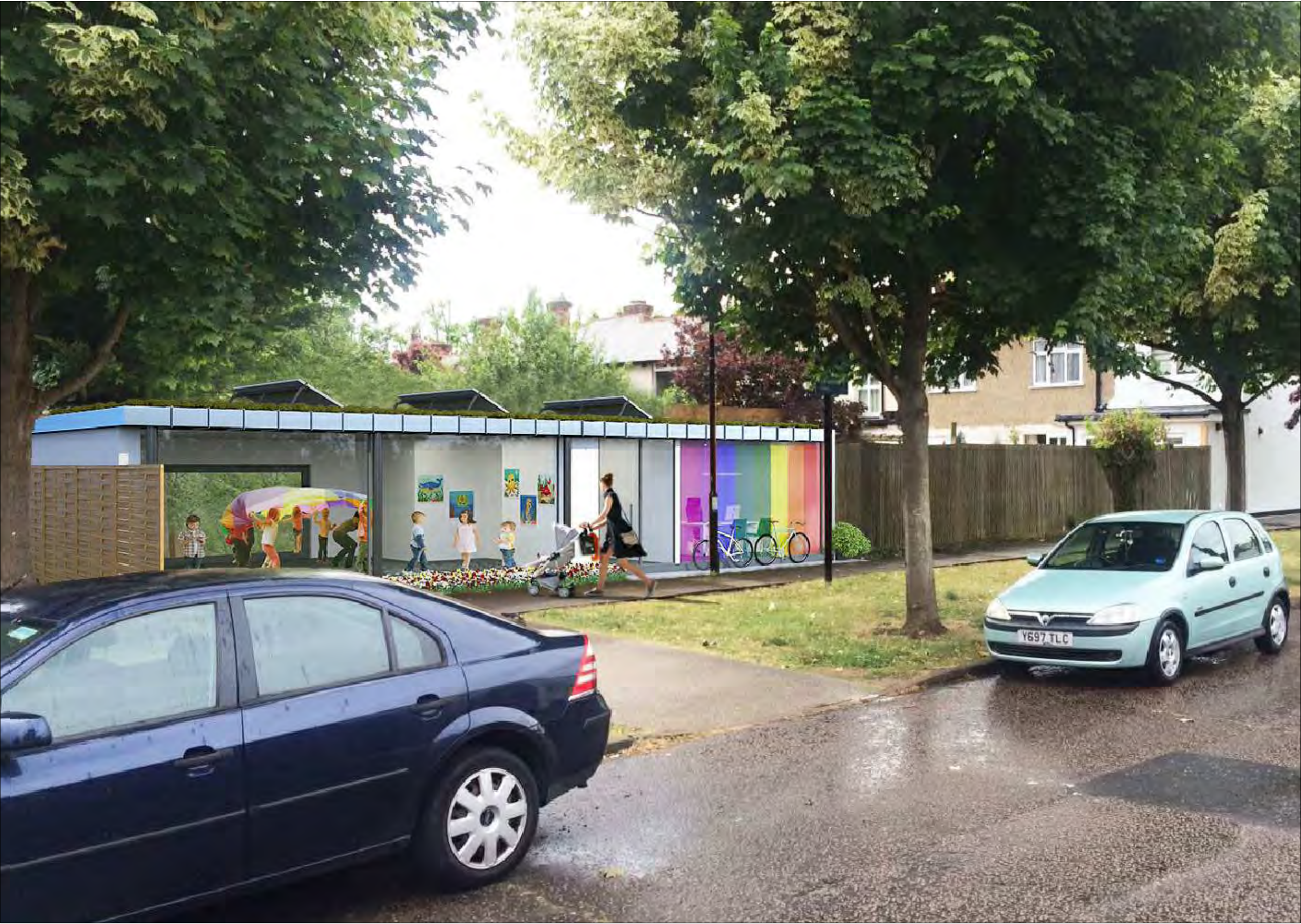
PROPOSED CGI VISUAL