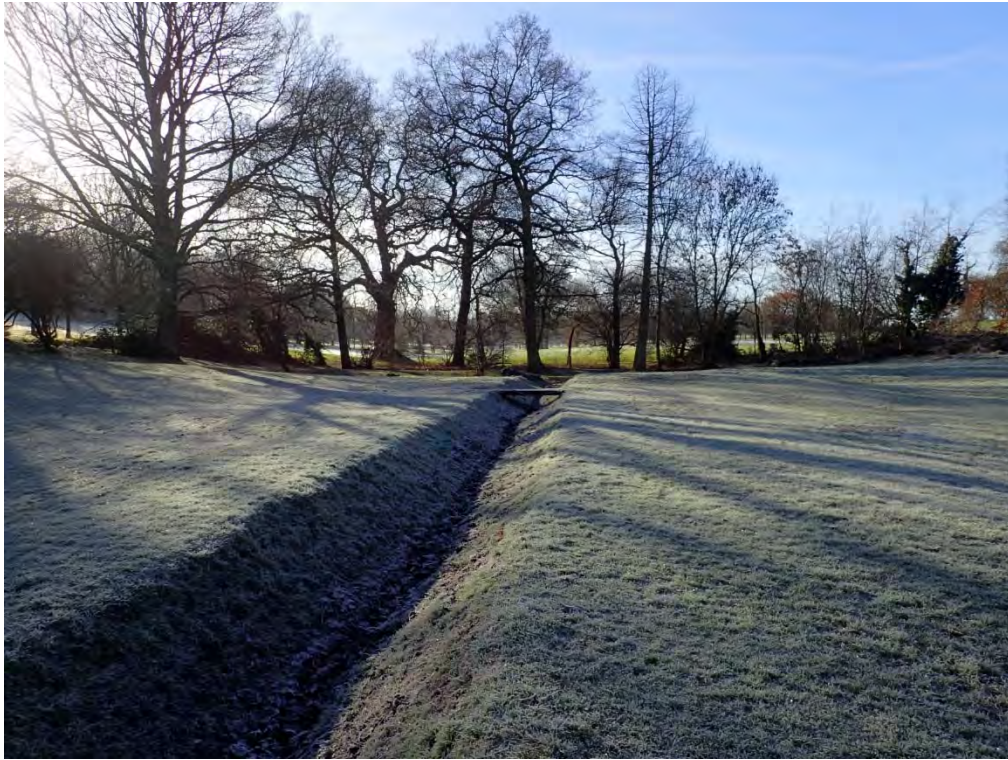
Plate 5 View of straightened ditch for stream, facing south