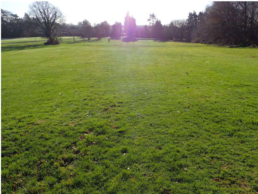
Plate 16 Potential boundary ditches, facing south