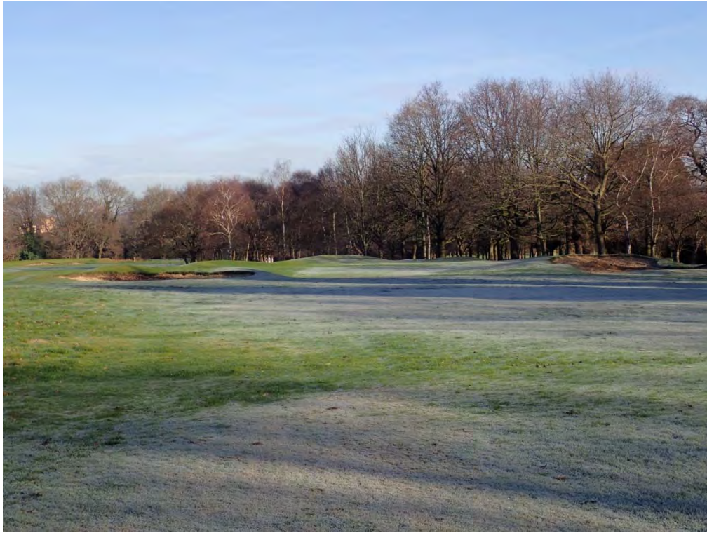
Plate 1 Area of Proposed Car Park, facing northwest