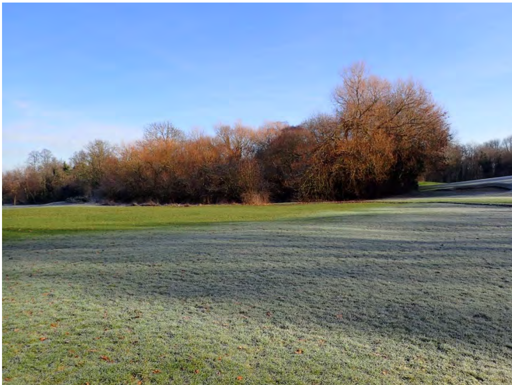
Plate 4 View of location of proposed artificial lake reinstatement, facing northeast