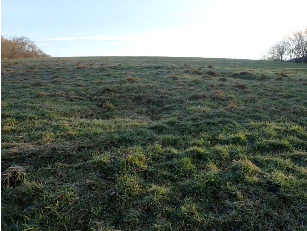
Plate 23 Potential location of Second World War anti-aircraft battery