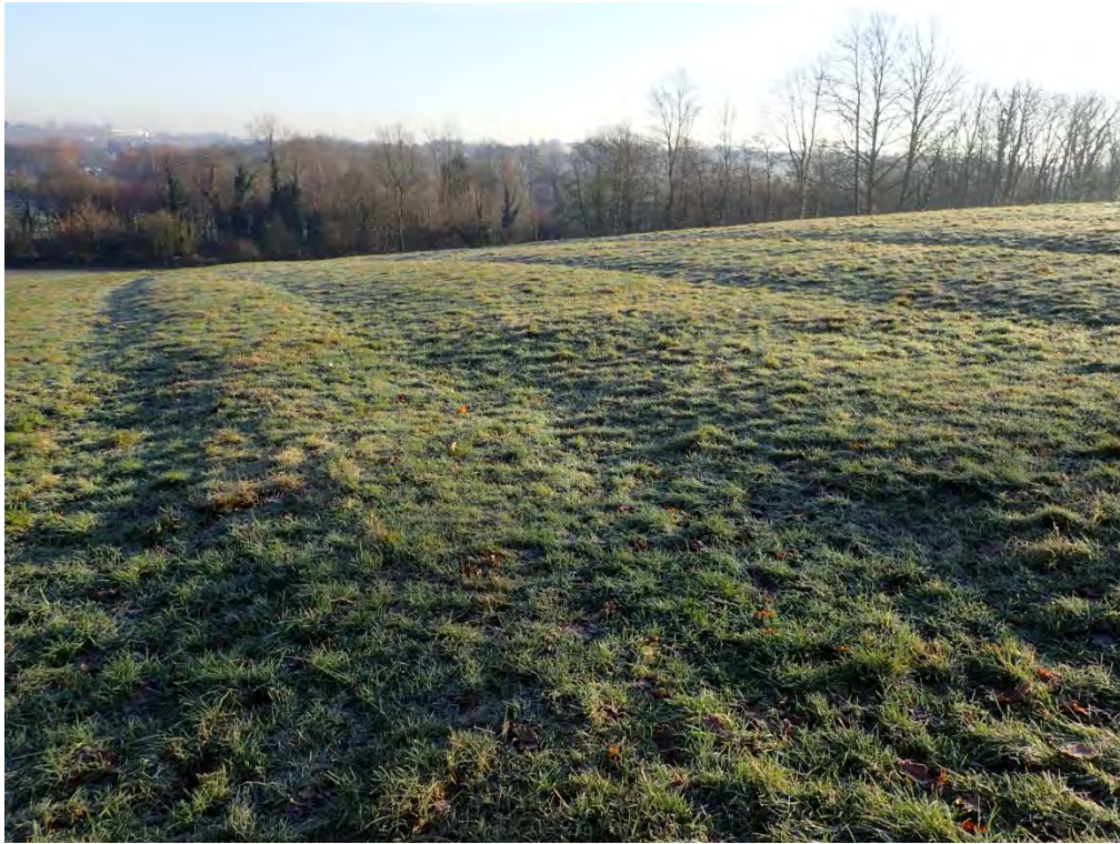
Plate 29 Potential terracing or ridge and furrow, facing east