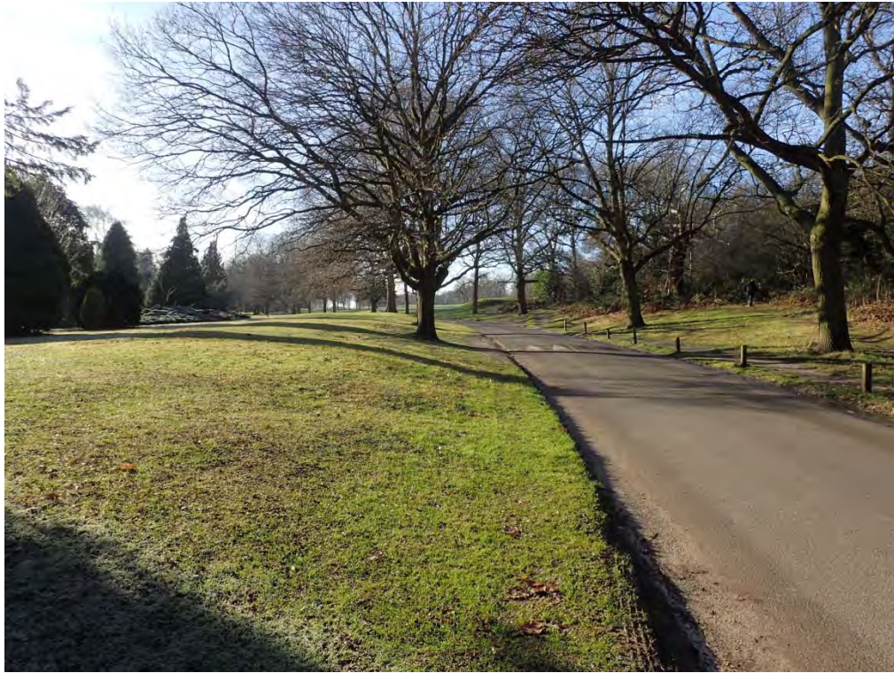
Plate 11 Carriage Drive proposed works access route, facing south