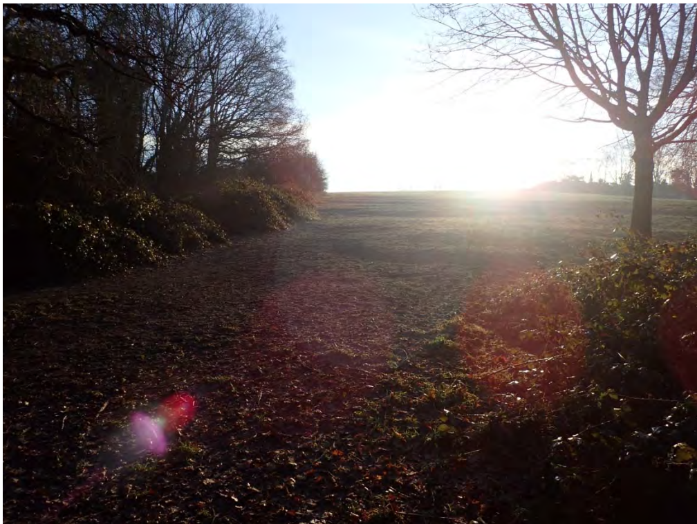
Plate 24 Crab Hill, facing southeast