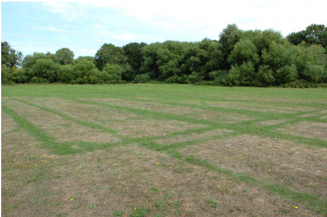
Plate 30 Cropmarks reported as indicative of the Prisoner of War camp remains, uncertain direction ( http://www.newsshopper.co.uk/news/13644877.Residents_reminisce_on_Beckenham_s_POW_camp/?ref=mr&lp=17 [accessed 26/01/17])