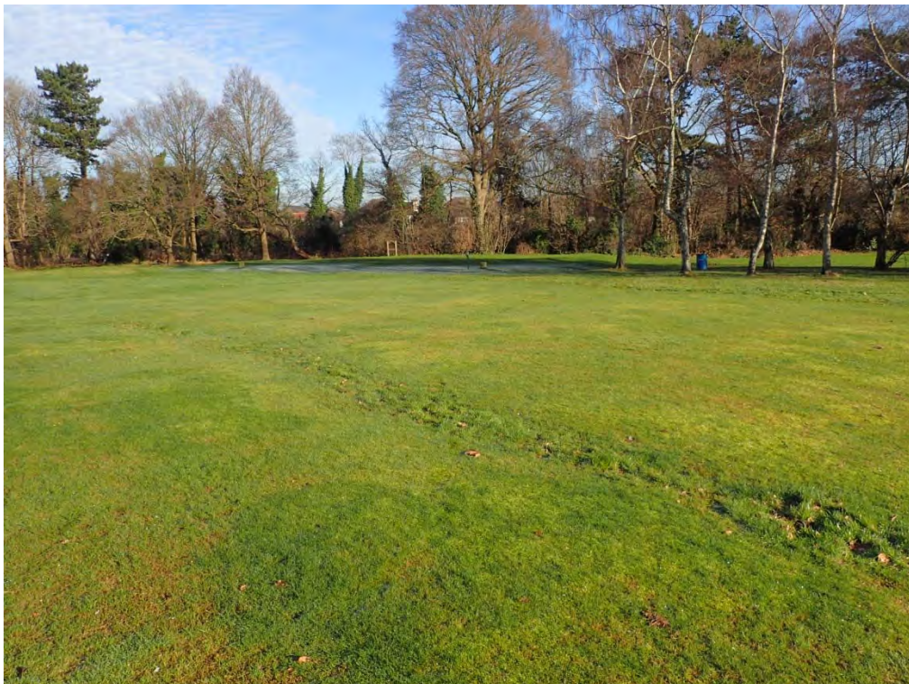
Plate 8 Potential boundary ditch, facing northeast