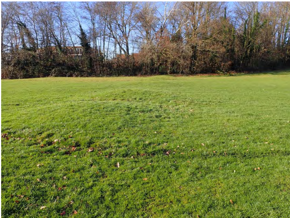
Plate 18 Potential boundary feature, facing northwest