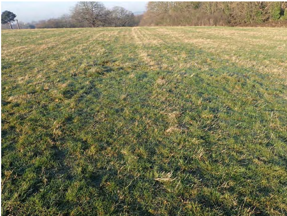
Plate 22 Crab Hill, facing west