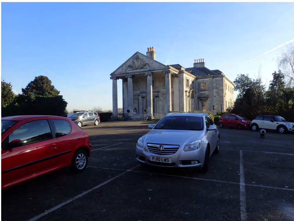
Plate 14 Mansion House and car parking area, facing east