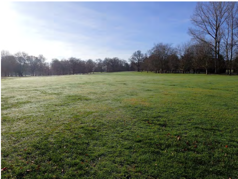
Plate 6 Potential field boundaries, facing southwest