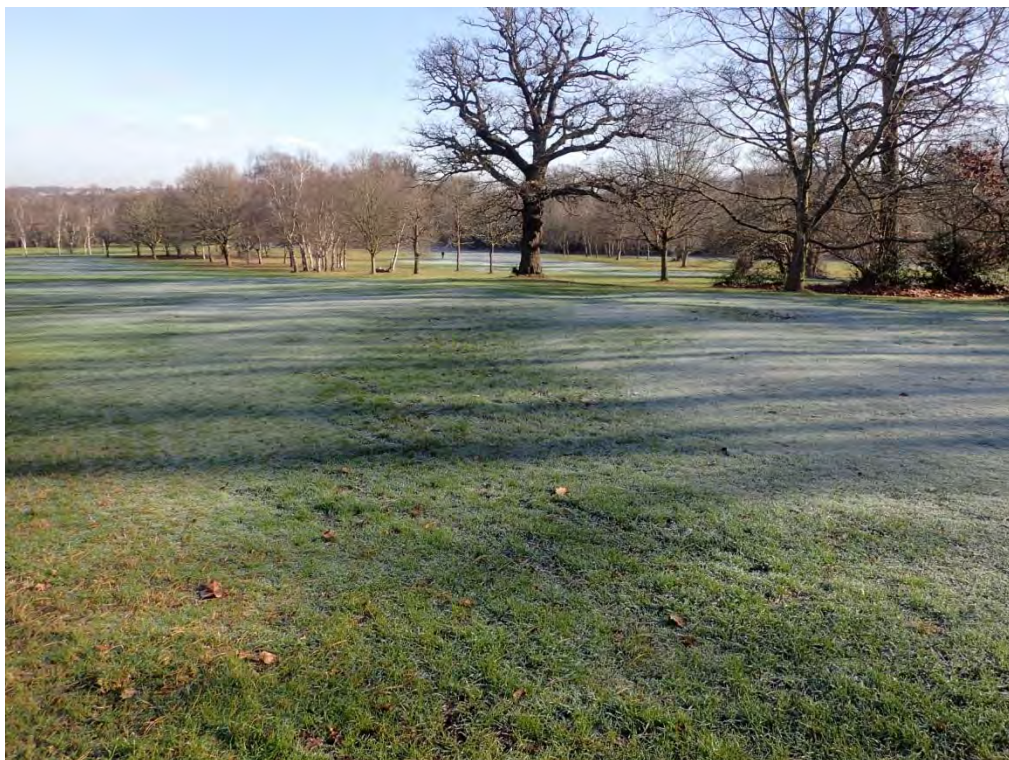
Plate 12 Potential archaeological feature, facing northwest