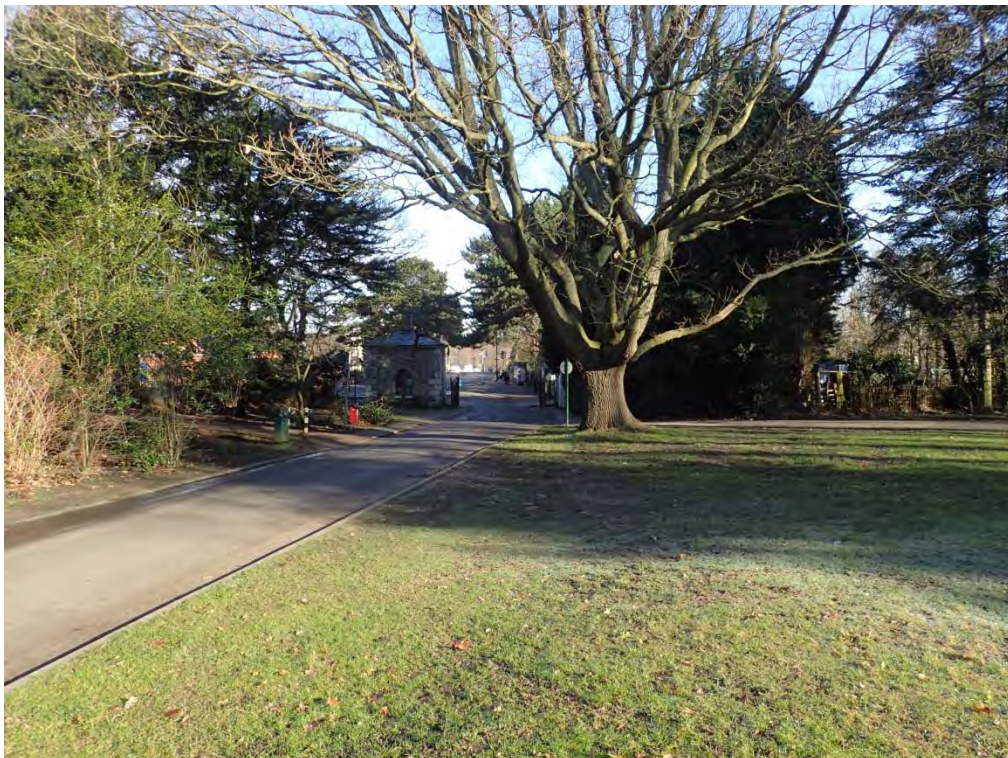
Plate 10 Southend Lodges (North Lodges), facing north