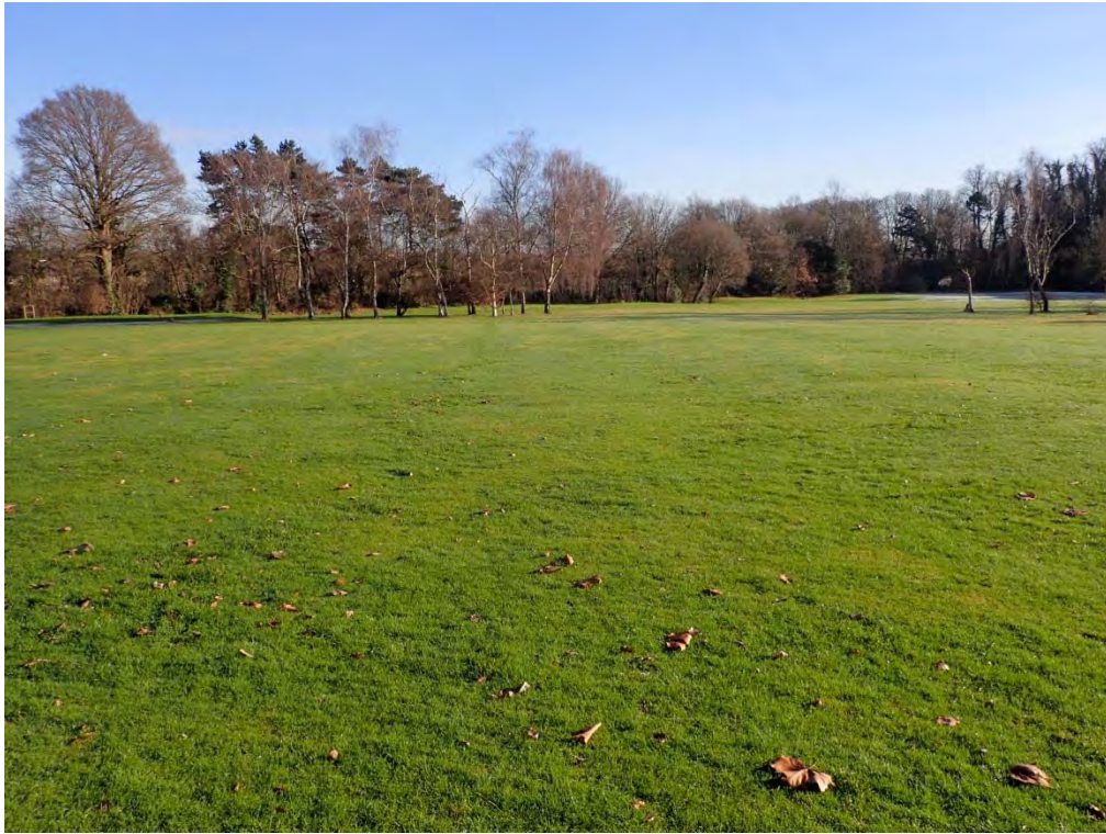
Plate 9: Potential ridge and furrow, facing east