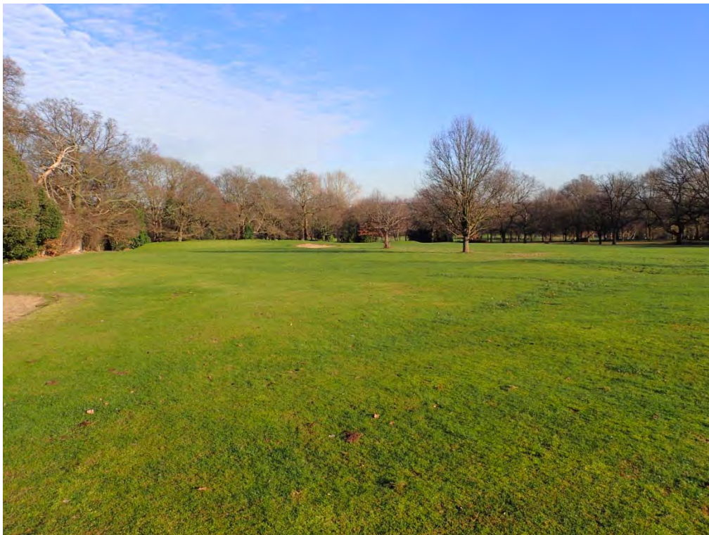
Plate 20 Potential boundary feature, facing northeast