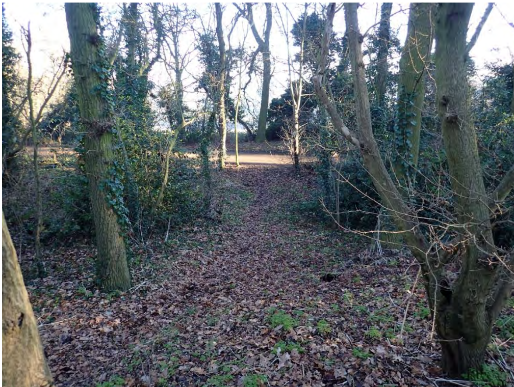
Plate 26 Holloway, facing northeast