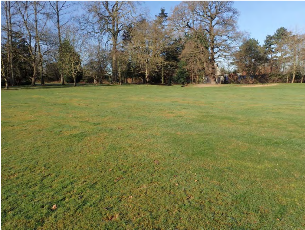
Plate 7 Potential ridge and furrow, facing northwest