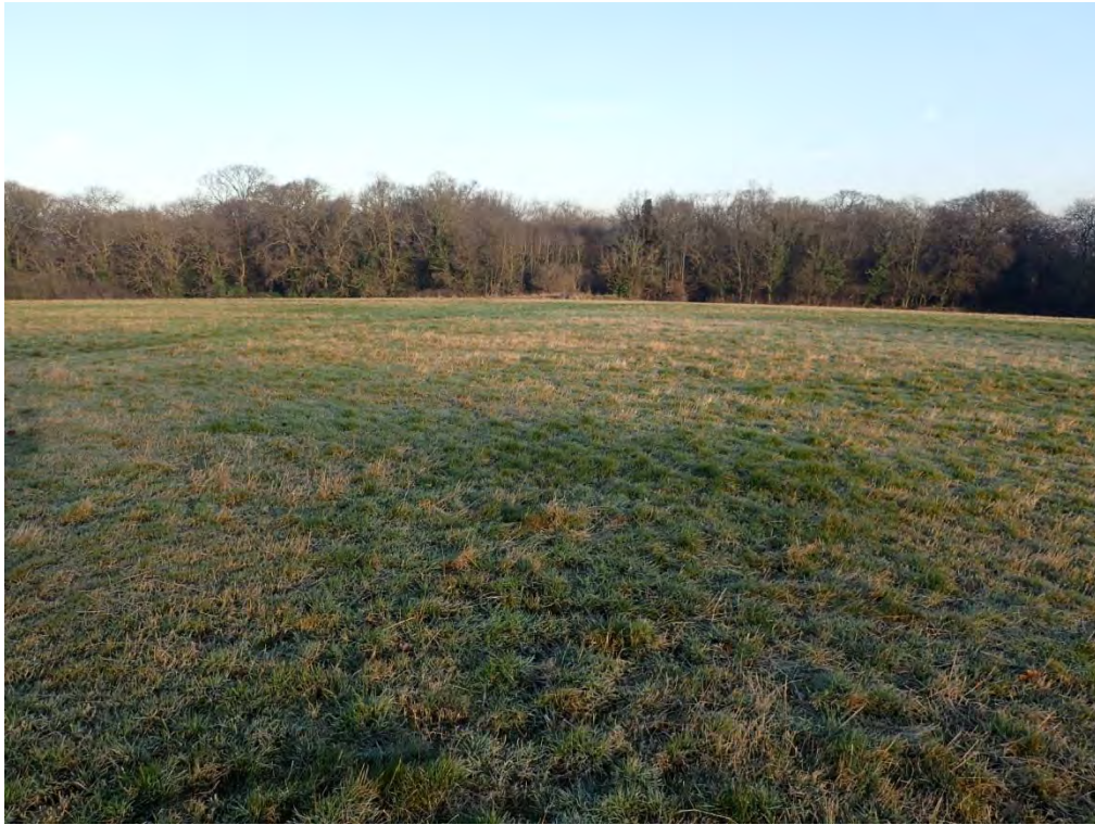
Plate 21 Crab Hill, facing north