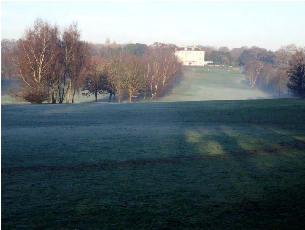
Plate 25 Rear of Mansion House, facing northwest