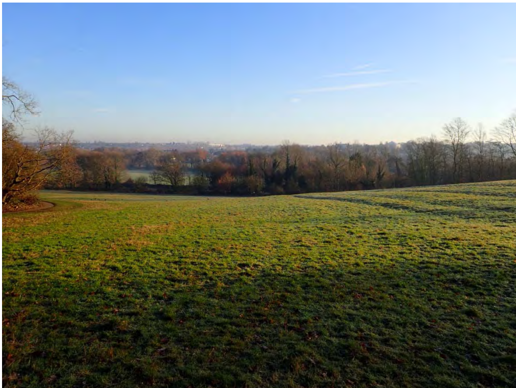
Plate 28 Railway Field, facing northeast