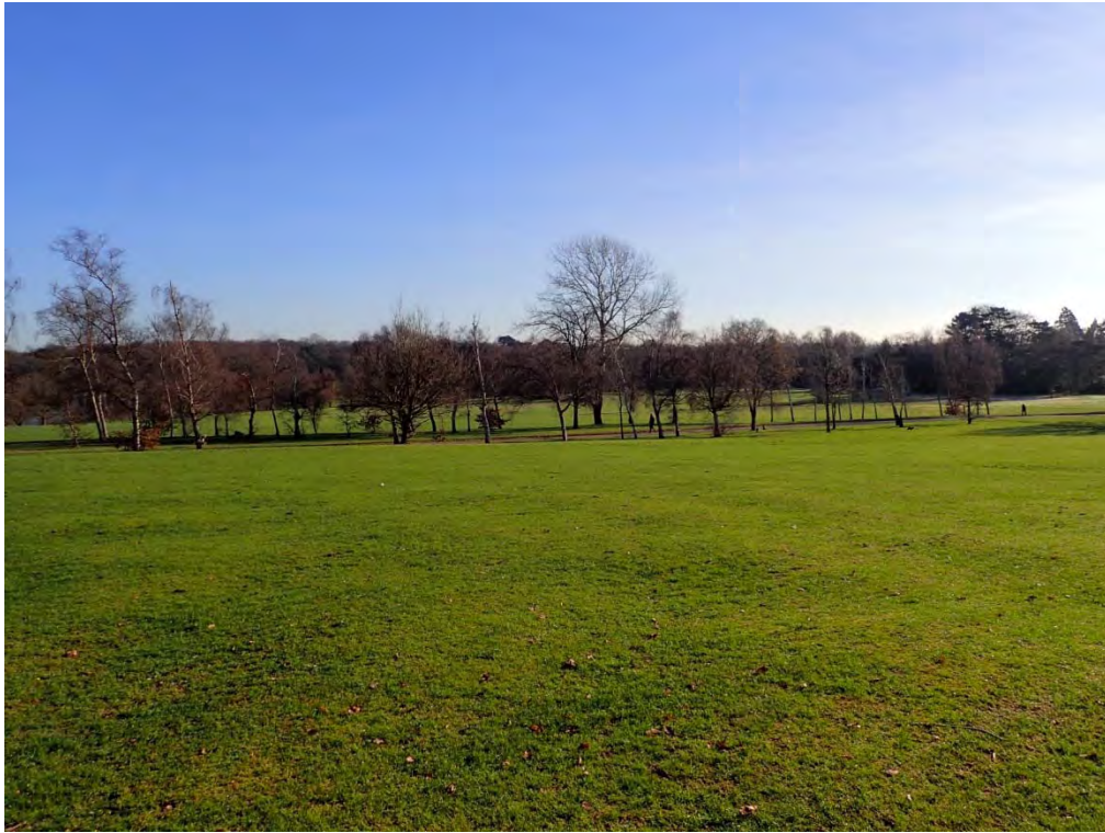
Plate 15 Potential ridge and furrow, facing southeast