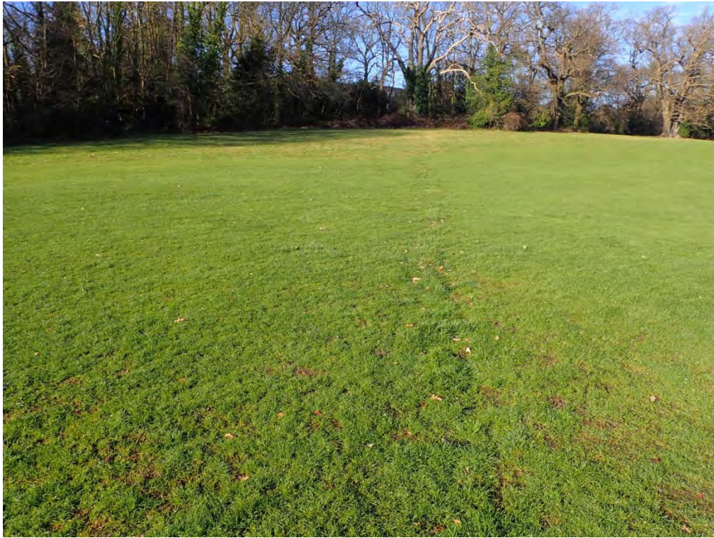
Plate 17 Potential boundary ditch, facing northwest