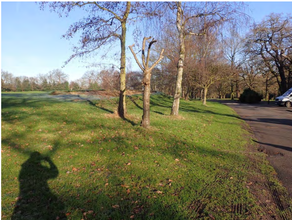
Plate 2 Area of Proposed Car Park, showing level difference from access road, facing north