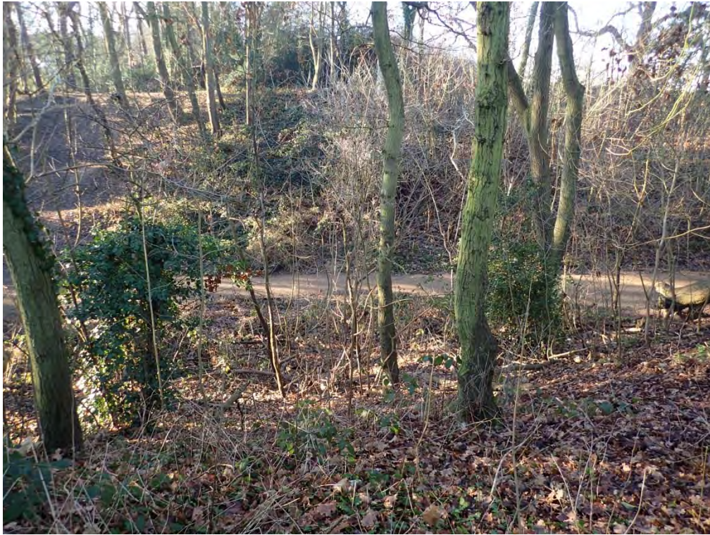
Plate 27 Holloway, facing southwest