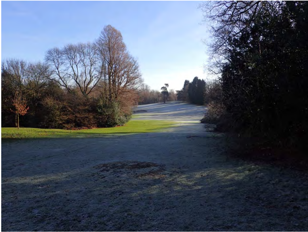
Plate 3 View towards valley location of proposed artificial lake reinstatement, facing east