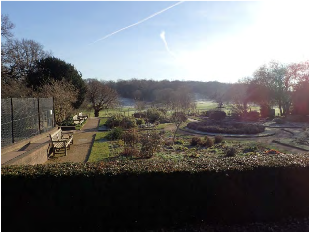
Plate 13 Current Pleasure Garden grounds, facing east