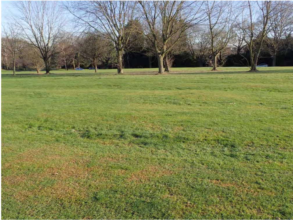
Plate 19 Potential ridge and furrow, facing east