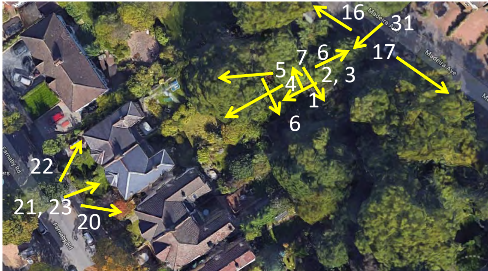
1 Satellite Image