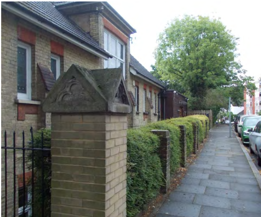
Figure 9 – Bromley Reform Synagogue