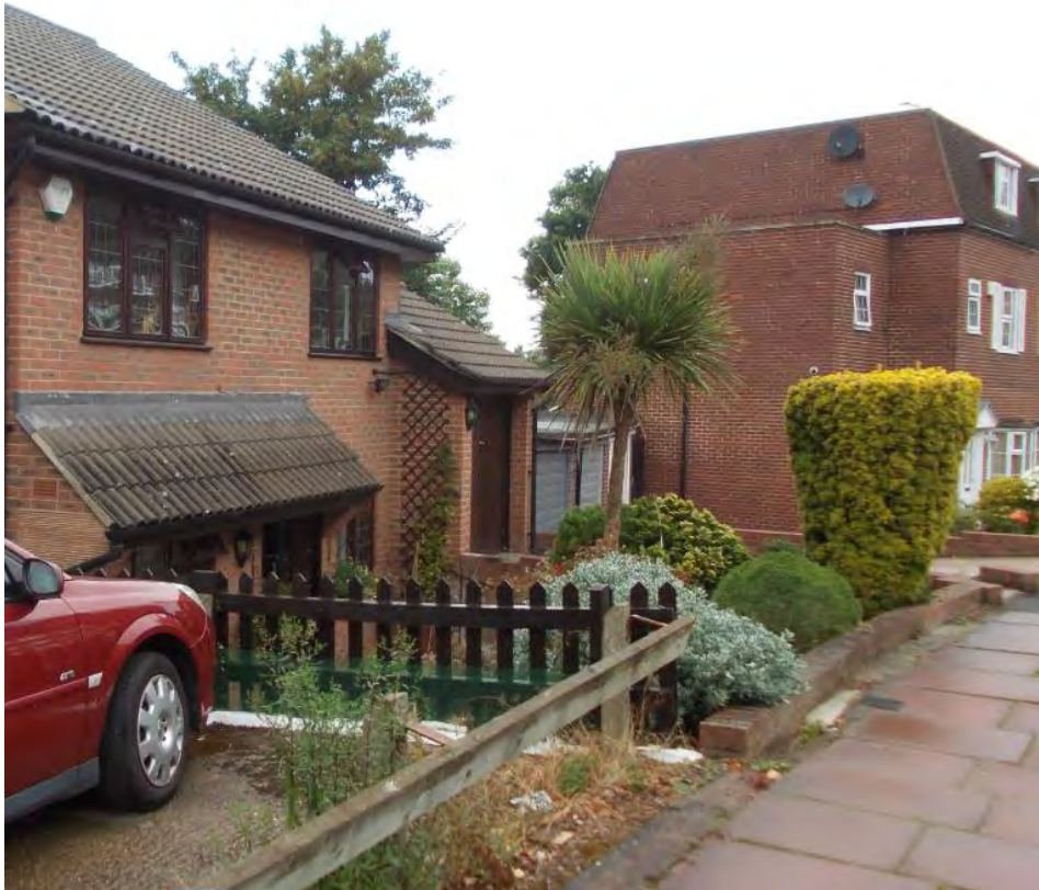
Figure 5 – Properties to the north of the proposal site

2.5. The site has no designations on the Bromley Proposals Map. It is not in any conservation area.