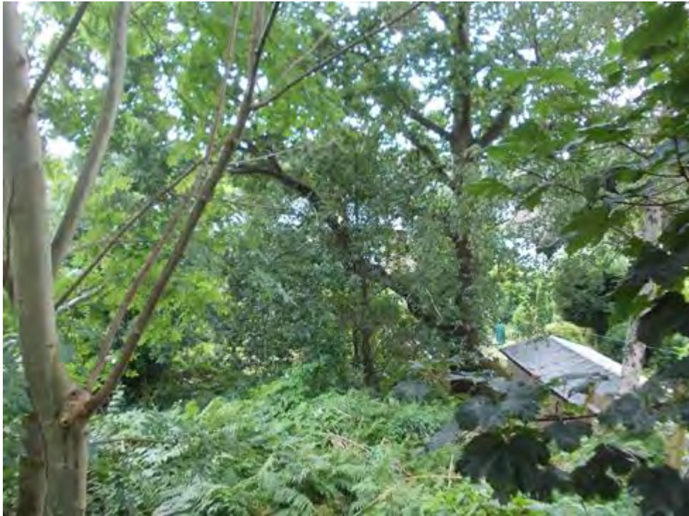
Figure 11 – Rear facing towards the host property showing tree line

5.28. In addition, the proposed house will be only one and a half stories in height at the rear with no windows above the ground floor.