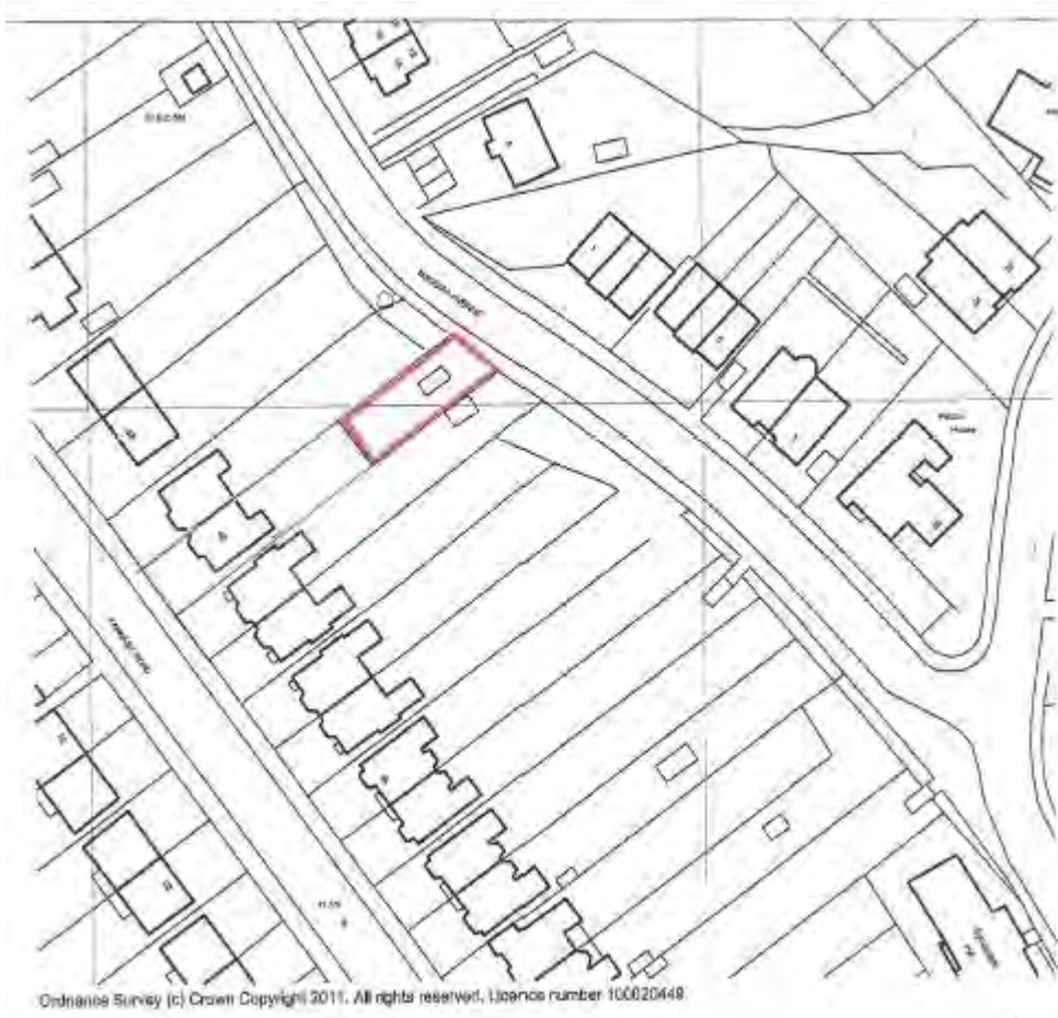
Figure 1 – Location Plan

2.2. The houses on Farnaby Road are predominantly semi-detached properties. In this section of the road, they have large gardens which slope upwards towards Madeira Avenue. The gardens have fences or walls to Madeira Avenue, and large amounts of vegetation.