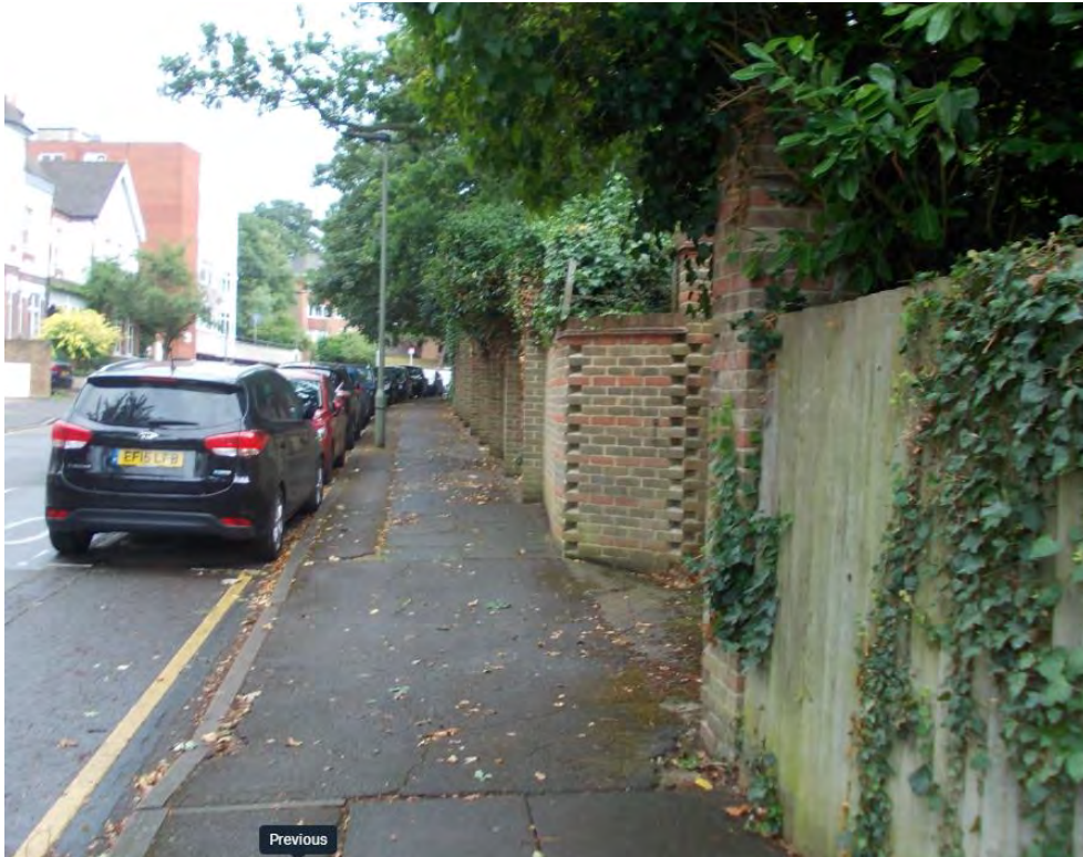
Figure 7 – Frontage including wall

5.21. The proposal will fill in part of this area. It will preserve the appearance of the streetscene and thereby local character.