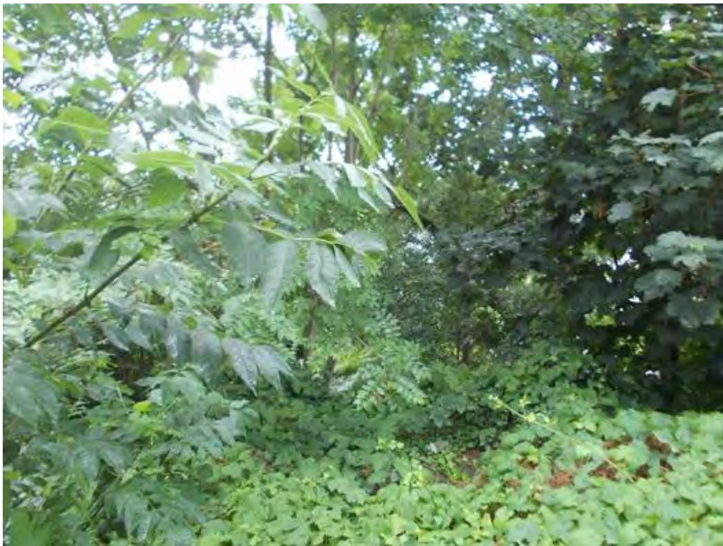
Figure 10 – Rear garden of property

5.27. The neighbouring garden will not be overlooked. Firstly due to the separation distance of 32 metres, which the officer's report acknowledges is generous. Secondly due to the large amount of landscaping, including trees, which will screen the property from the gardens of the Farnaby Road properties.