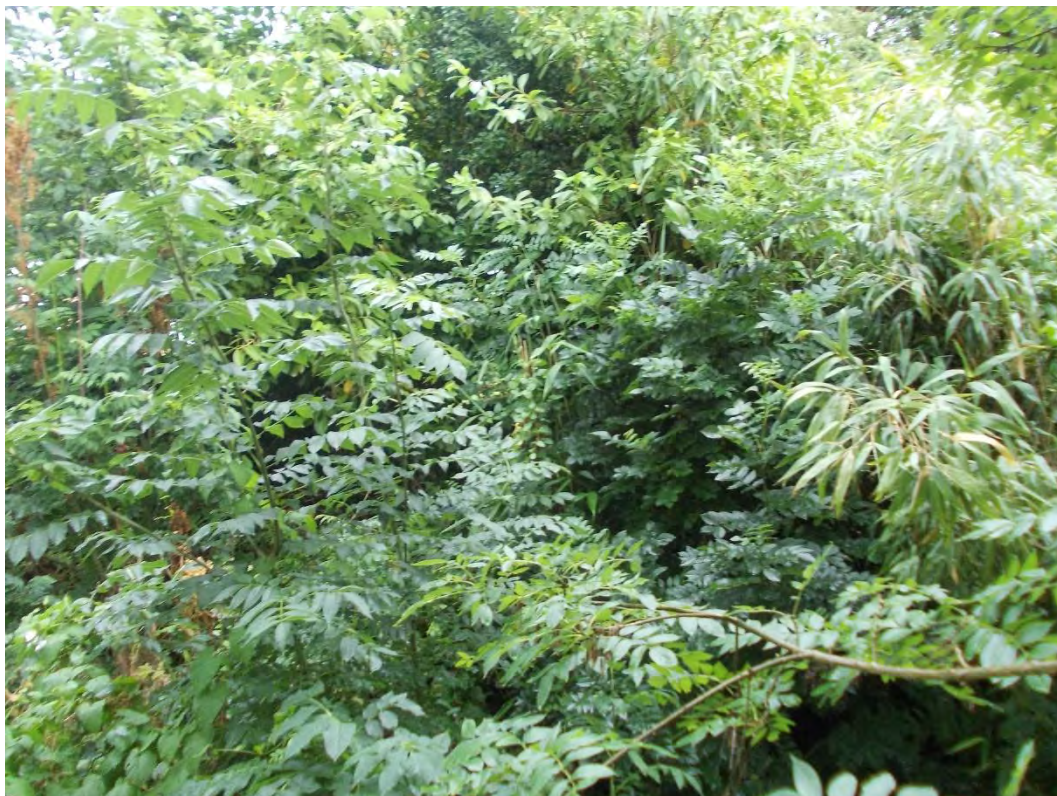
4 Side view