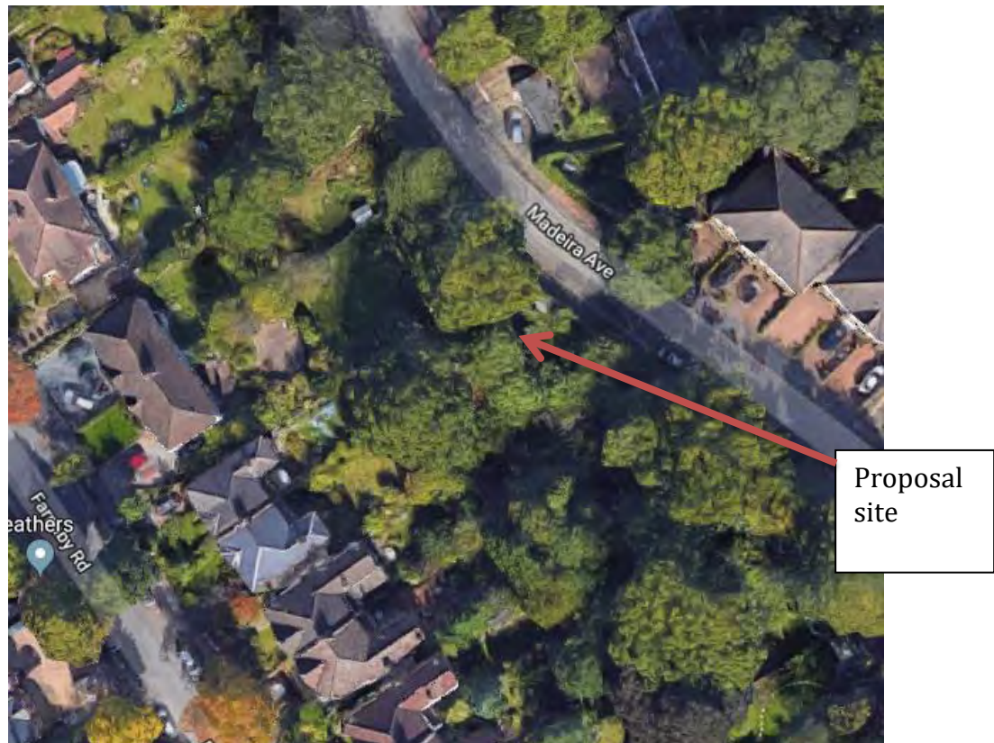
Figure 2 – Aerial view of the site