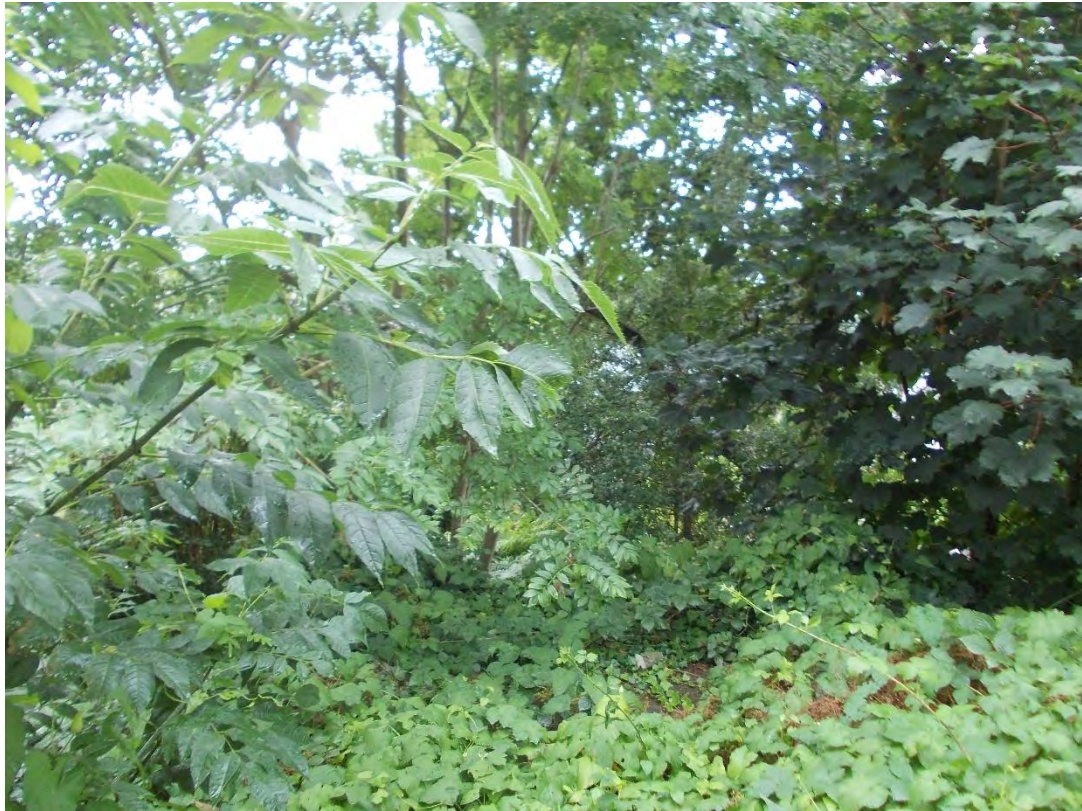
5 Rear of garden of property