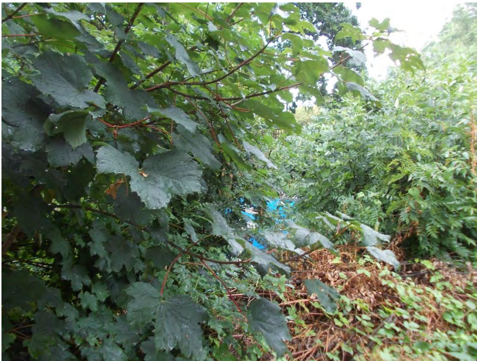
8 Right side of rear garden of site