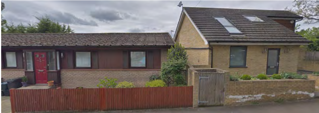
Figure 8 – Modern infill houses to the south of the site

5.25. Close to the site, to the north, there is development on both sides of the road, including modern three-storey houses (see Figure 5). Further to the south, where Madeira Avenue becomes Highland Road, there are two further modern infill houses (28A and 30 Highfield Road) on this side of the road, as well as the Bromley Reform Synagogue. There is therefore a clear precedent for infill development on this side of the road and the proposed modest two story house will fit into its surroundings.