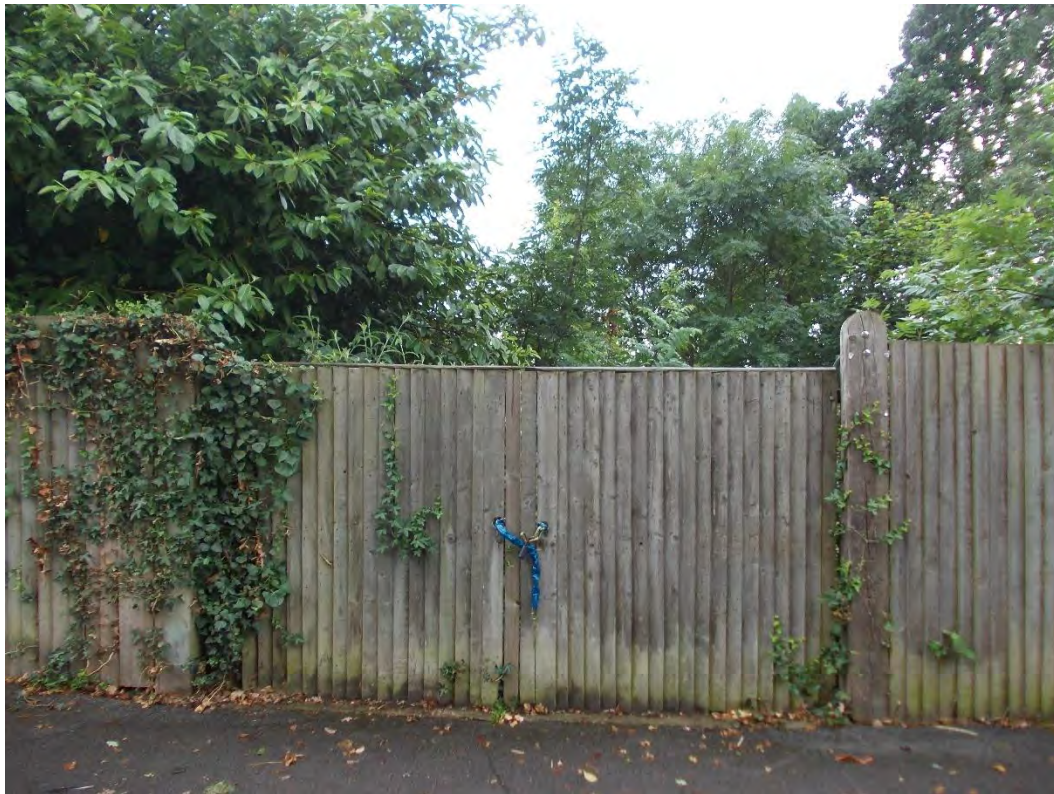
3 rear view of site entrance