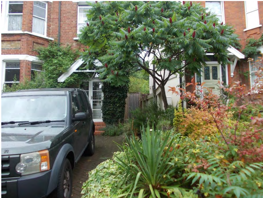
2 Street Facade of host dwelling