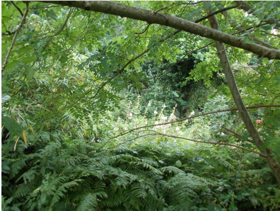
7 Left side of the rear garden of site