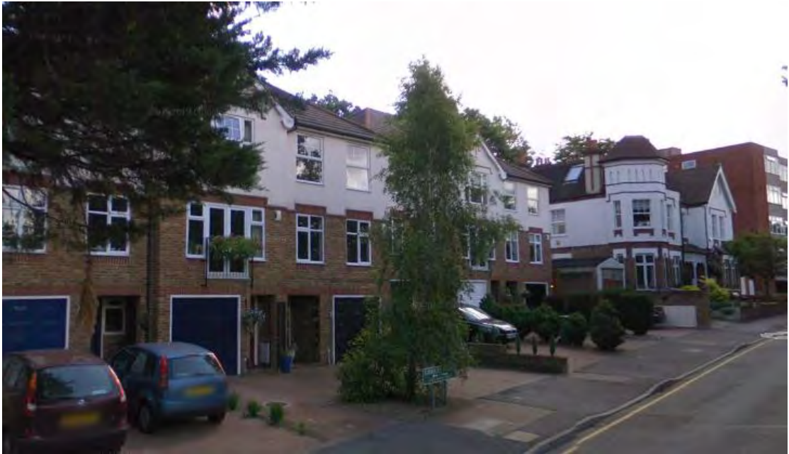
Figure 4 – Opposite side of Madeira Avenue

2.3. Opposite the site are residential dwellings, several of which are three or four storeys high.