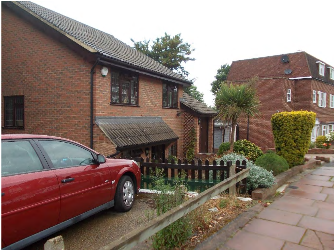
9 Pictures of street scene around site showing other rear garden developments.