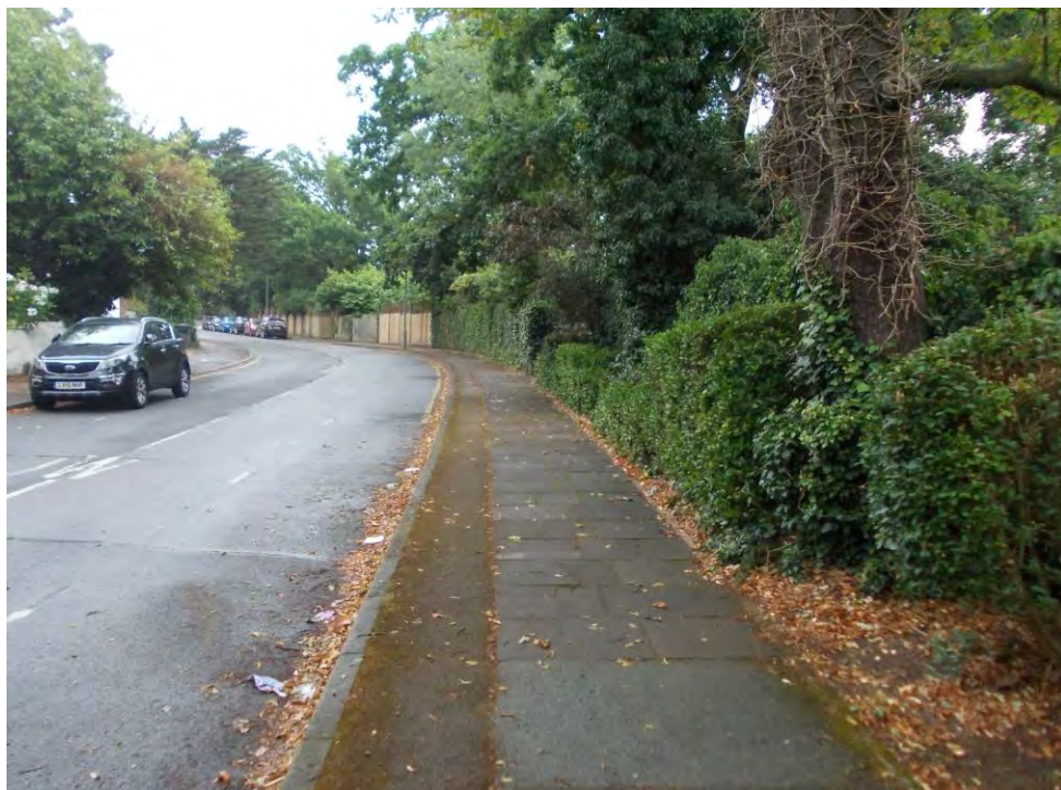
Figure 3 – View along Madeira Avenue