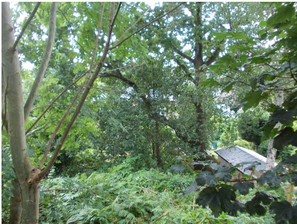
6 Rear facing towards the host property showing tree line