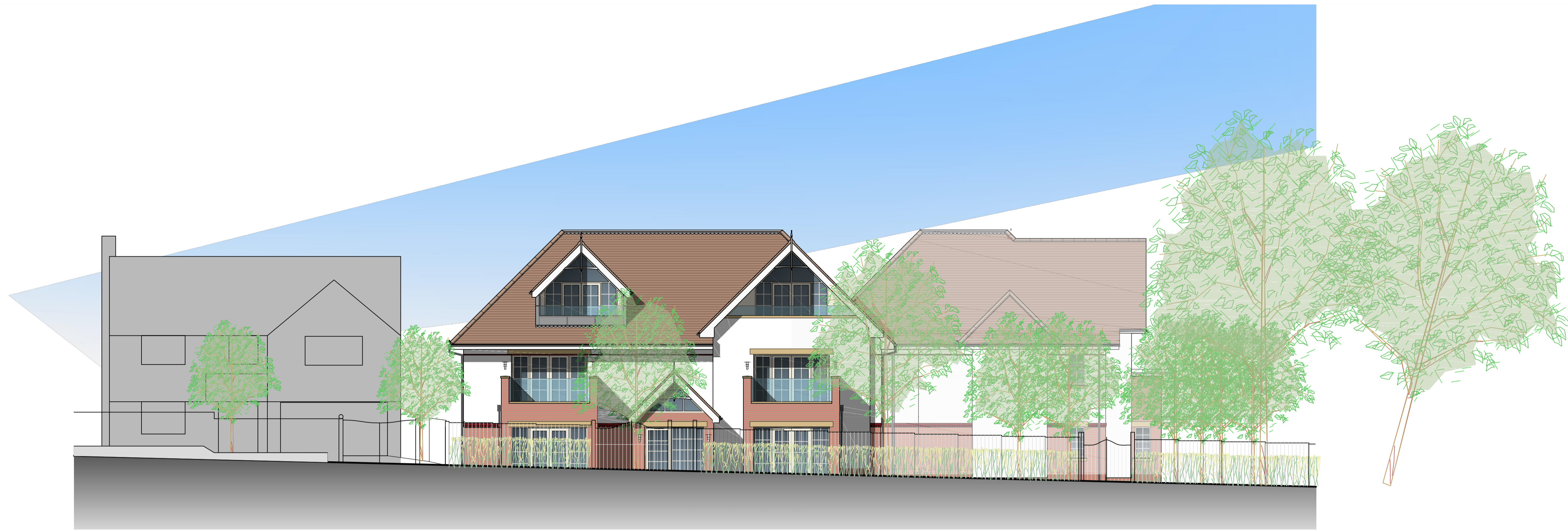
59A The Avenue