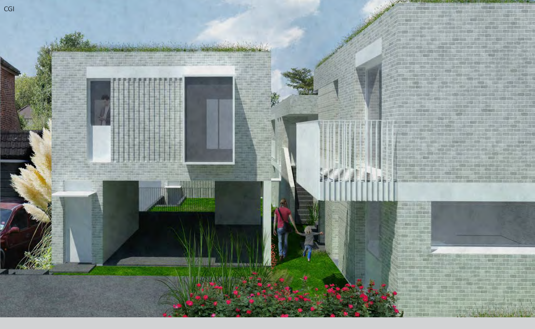
26 Hillbrow Road, Bromley, Kent BR1 4JL Development site for sale STPP