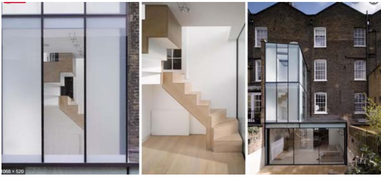
(Islington Architects Ltd with Cantifix Glazing)