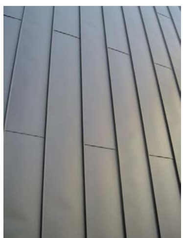
Proposed zinc cladding

A modern contemporary dwelling using high quality materials inc. zinc cladding with framed and 'frameless' glazing with porcelain tiles cladding the front façade in a Herringbone design, returned around the side elevations.