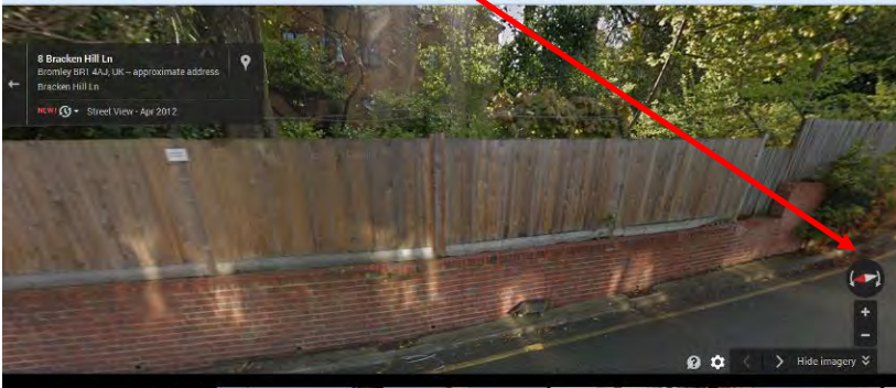
Note the corresponding positions of the shrubs on the wall