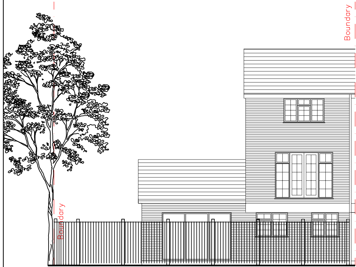
Proposed rear elevation (South East facing)