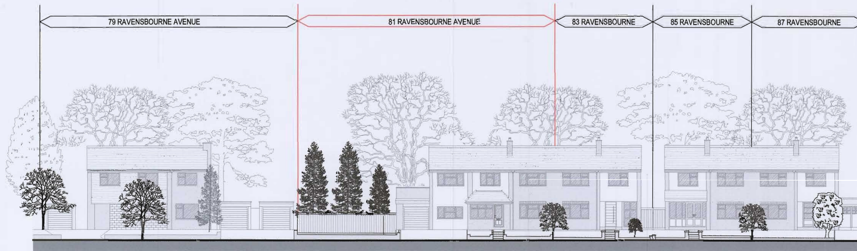
EXISTING STREET ELEVATION FROM RAVENSBORNE ROAD NORTH EAST

This drawing is to be read in conjunction with all relevant consultant's drawings/documents and any discrepancies or variations are to be notified to Apex Architecture before the affected work commences.