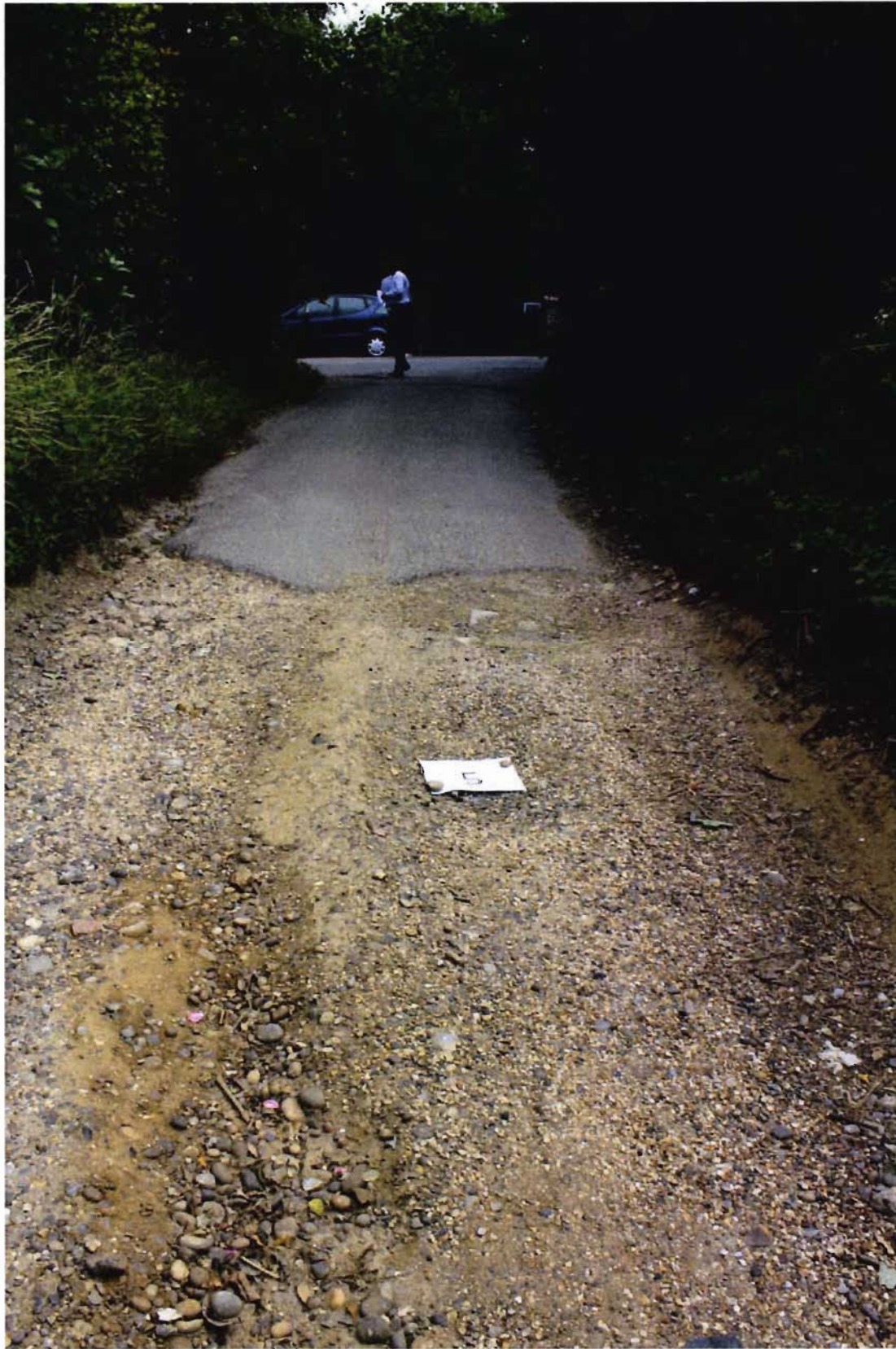
Picture 21: Item 5 Uneven road surface and potholes approaching Coniston Road.