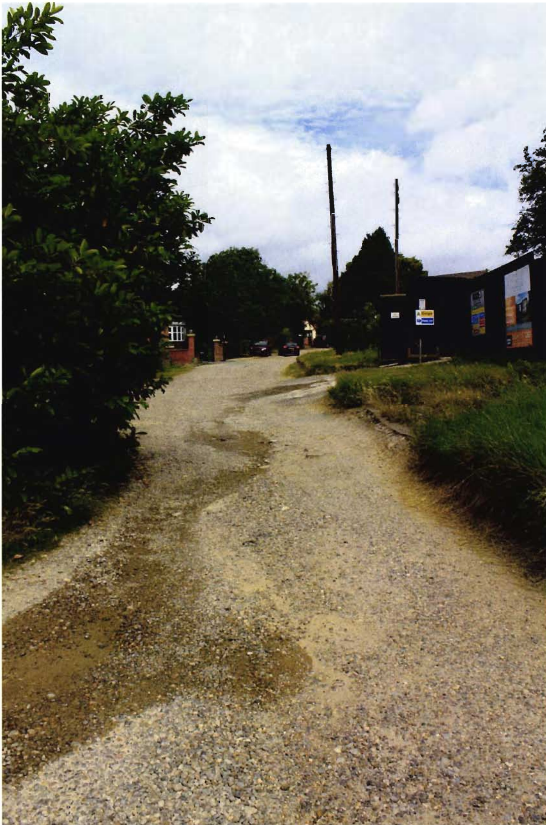
Picture 11: Standing Parallel to Tresco Close, the continued view up Hilbrow Road, also capturing the entrance to the neighbouring development at Sunset Hill.