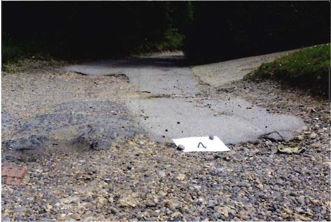
Picture 20: Item 4 Road surface in poor condition outside number 14.