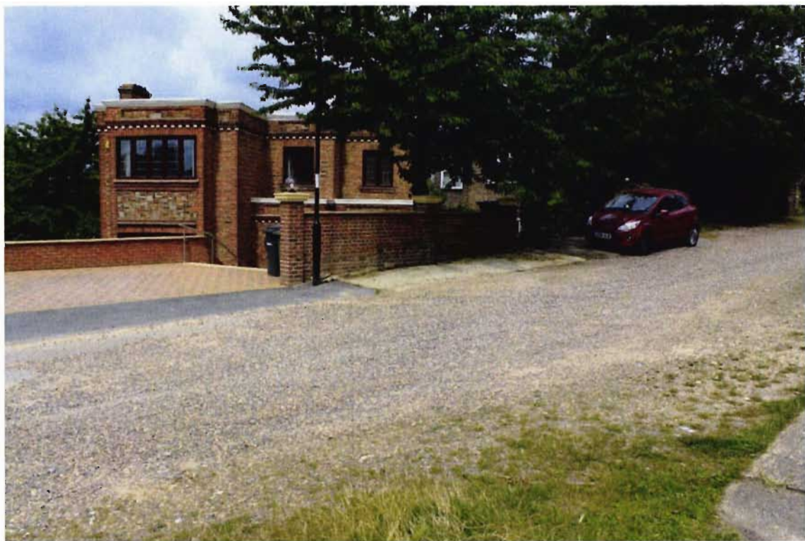
Picture 17. Standing on the driveway of Upfield looking Right.