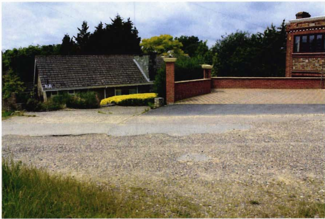
Picture 16. Standing on the driveway of Upfield, looking straight on.