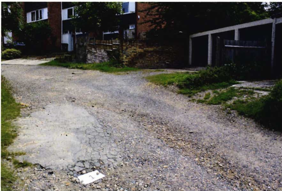
Picture 4: Item 1 identifies a patch of tarmac in poor condition opposite the garages.