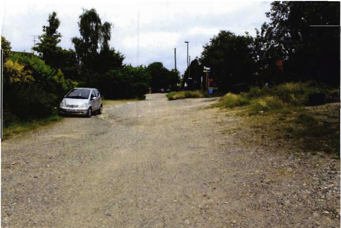
Picture 7: Some erosion shown beneath the car opposite Tresco Close.