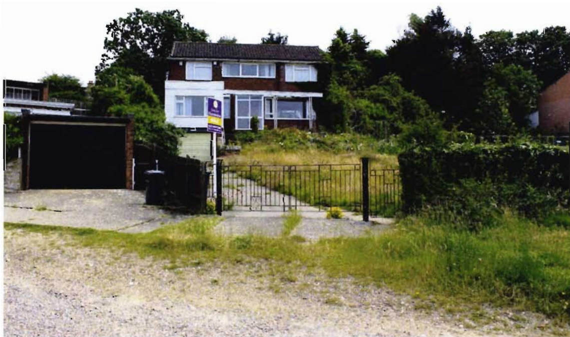
Upfield, Hillbrow Road as seen July 8th 2016