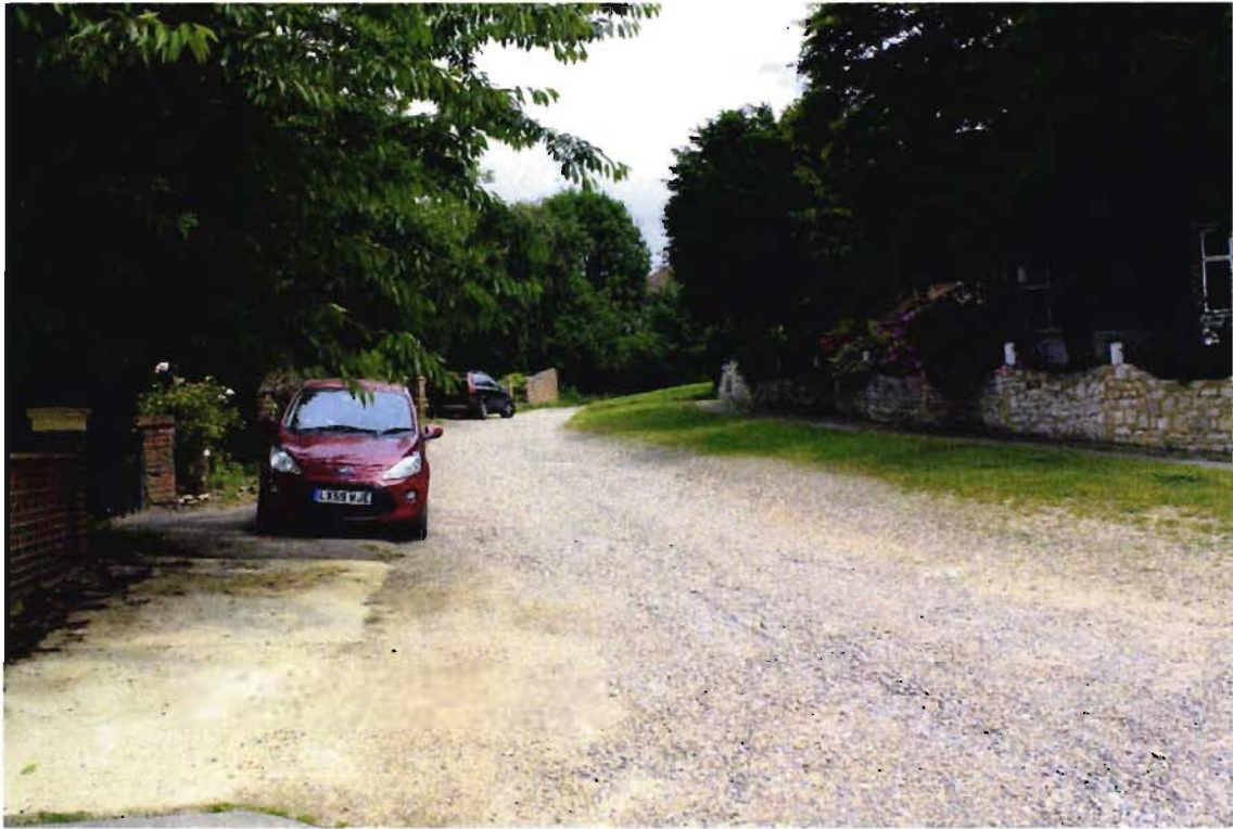
Picture 18: View continuing North with Romany Ridge shown on the right.