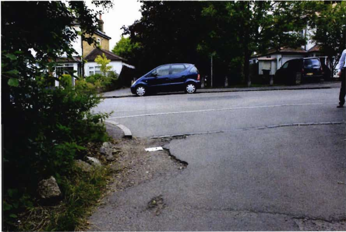
Picture 22: Item 6 Damaged Tarmac on the corner of Coniston Road / Hilbrow Road.