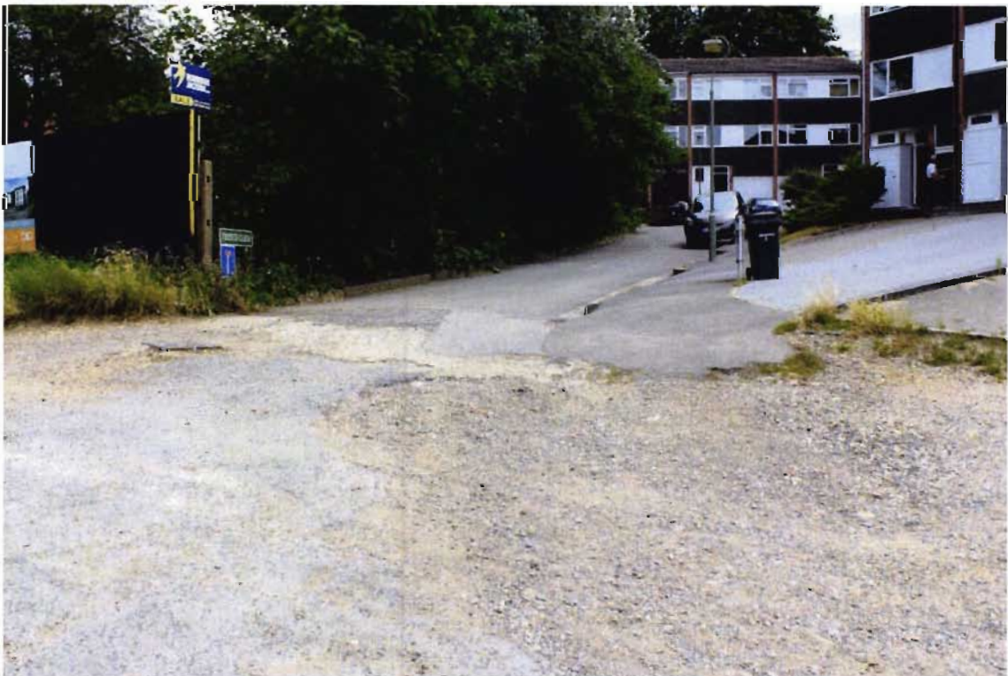
Picture 10: Shows the uneven road surface and mixed use of materials leading into Tresco Close.