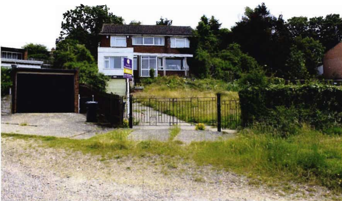
Picture 13: Showing the front elevation of Upfield and the neighbouring garages of Romany Ridge.