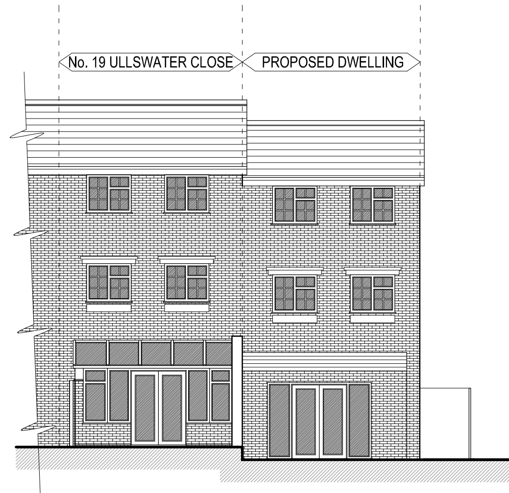
REAR ELEVATION (NORTH EAST)