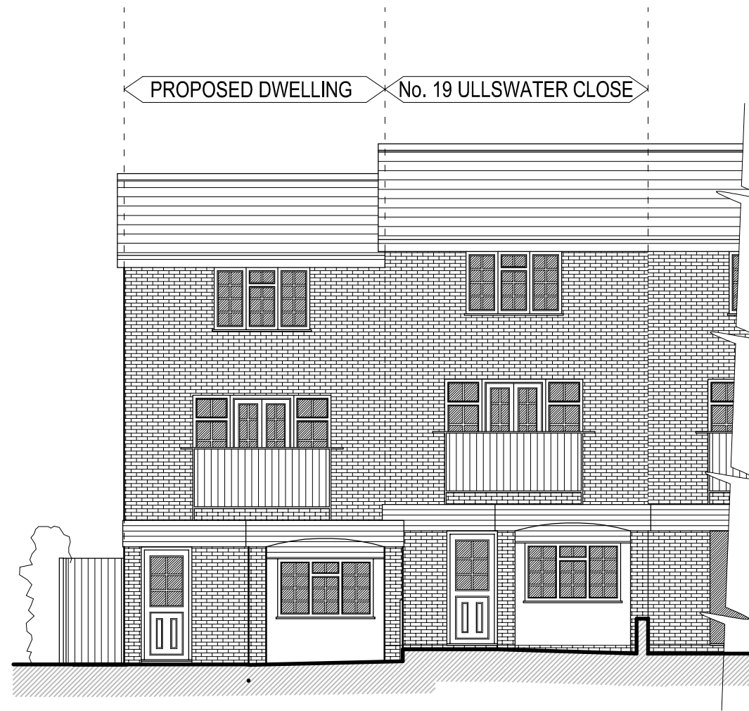
FRONT ELEVATION (SOUTH WEST)

This drawing is to be read in conjunction with all relevant consultant's drawings/documents and any discrepancies or variations are to be notified to Apex Architecture before the affected work commences.