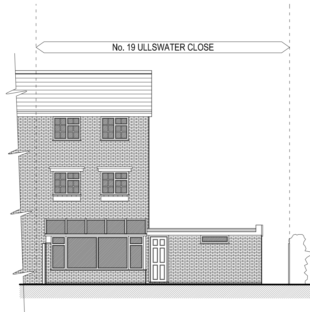
REAR ELEVATION (NORTH EAST)