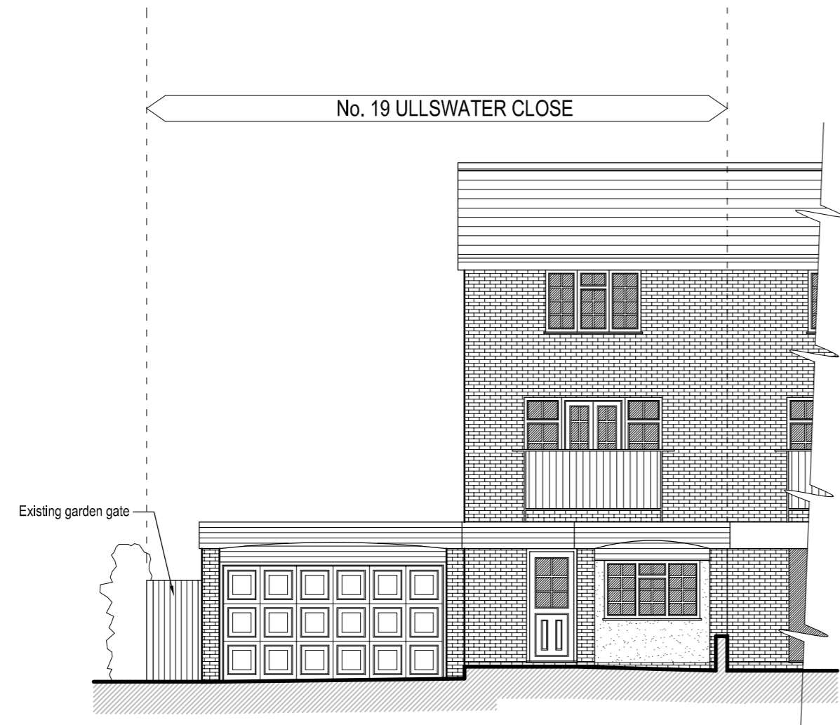
FRONT ELEVATION (SOUTH WEST)

This drawing is to be read in conjunction with all relevant consultant's drawings/documents and any discrepancies or variations are to be notified to Apex Architecture before the affected work commences.