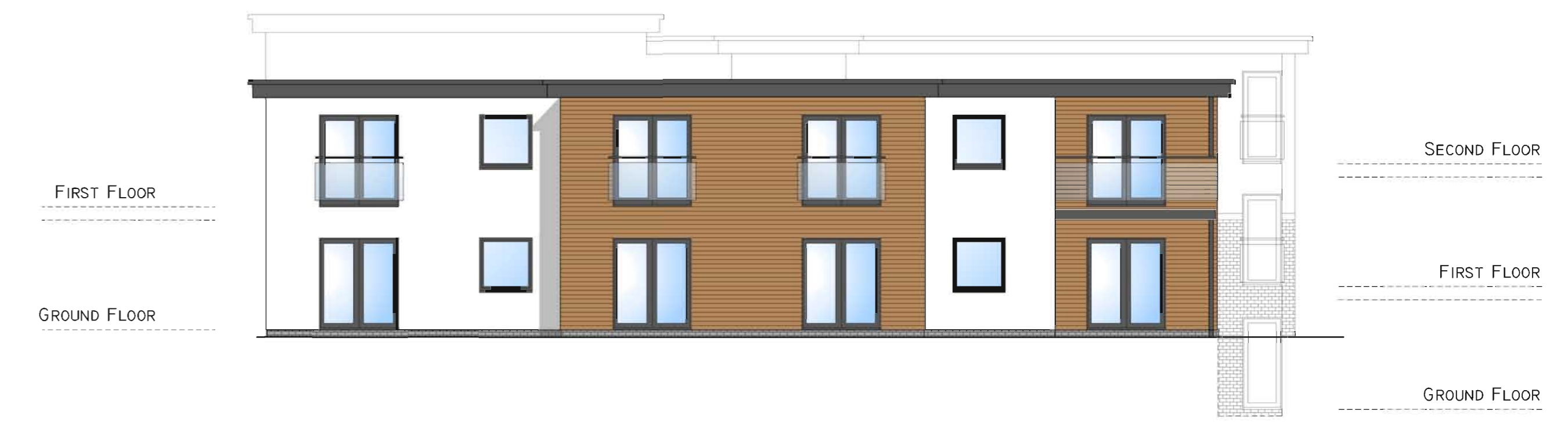
REAR (NORTH-EAST) ELEVATION