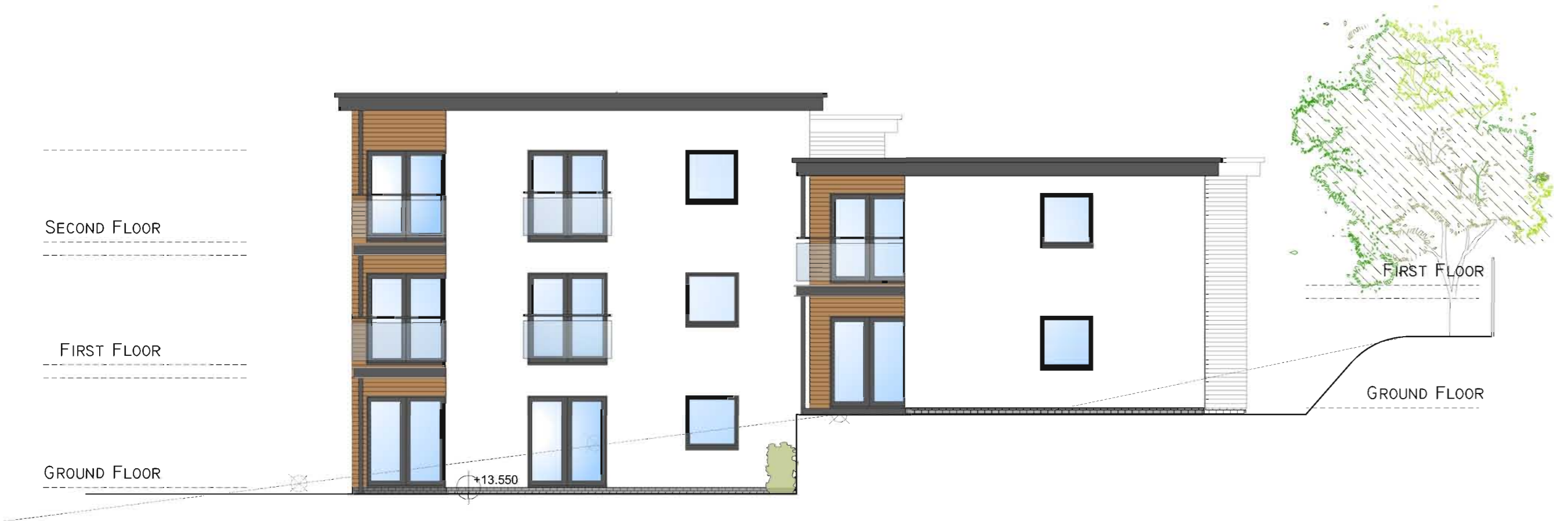
SIDE (SOUTH-EAST) ELEVATION