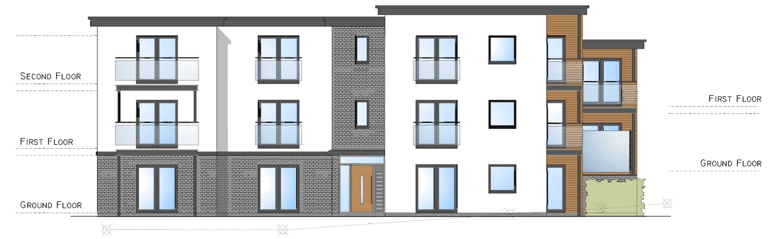
FRONT (SOUTH-WEST) ELEVATION