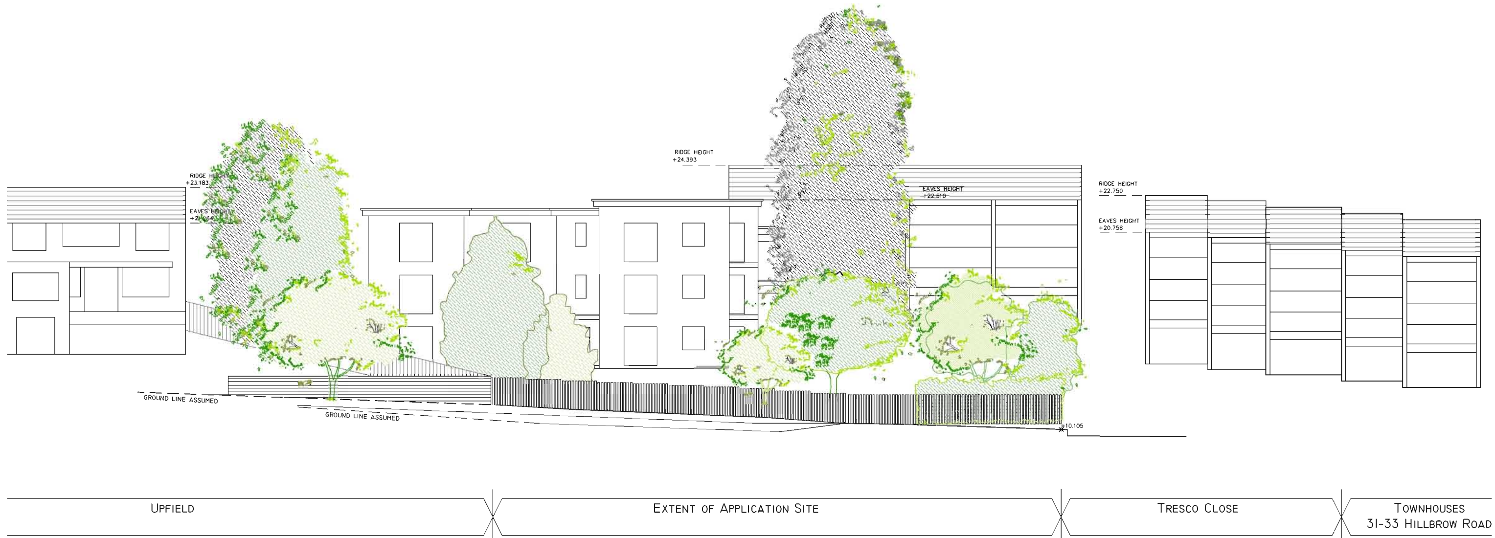
INDICATIVE STREET SCENE

Notes: Do Not Scale. Use only figured dimensions. All dimensions to be checked on site prior to construction. Any discrepancies to be notified to the architect. All Copyright Reserved to bhd architects.