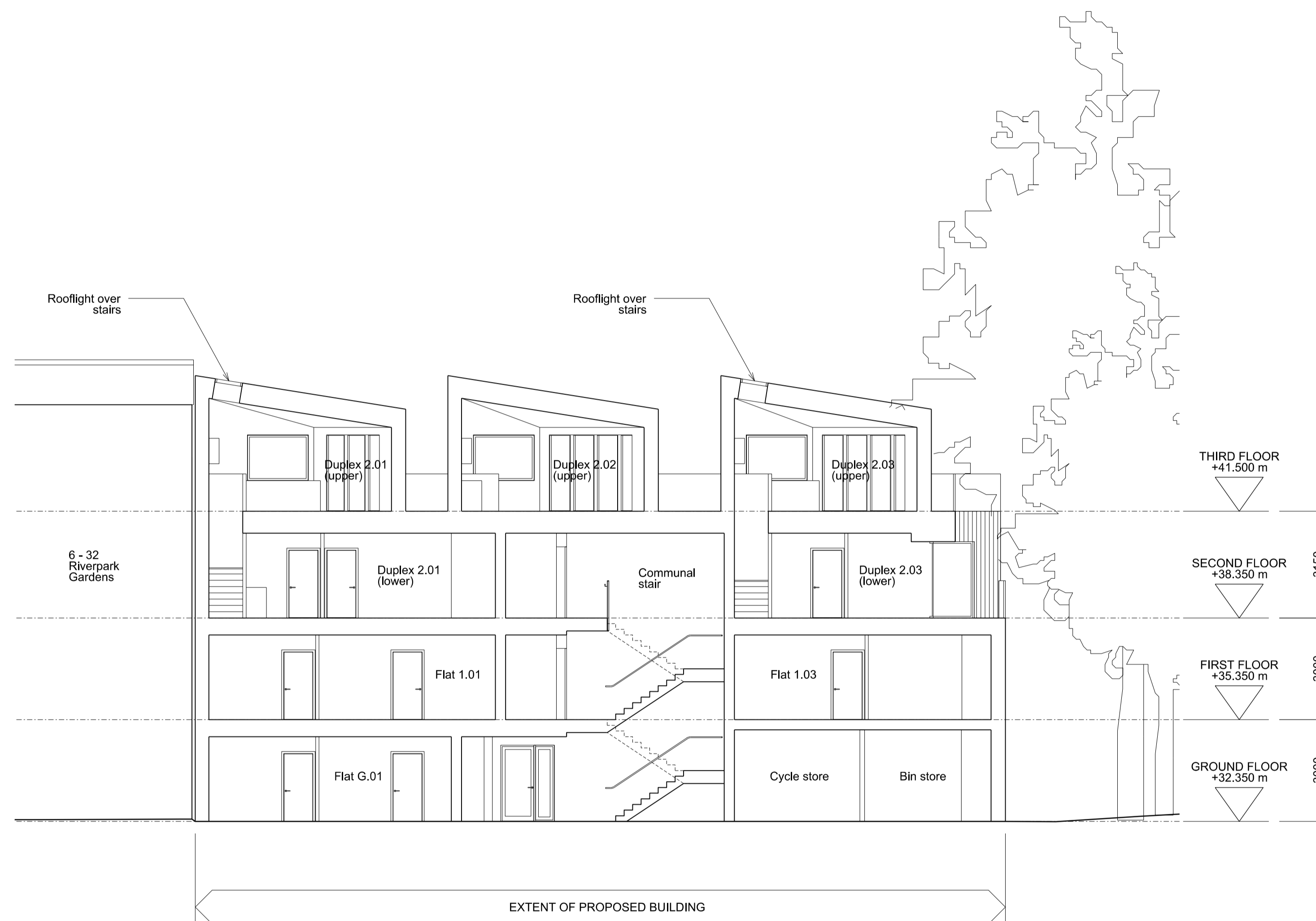
01 PROPOSED SECTION C-C