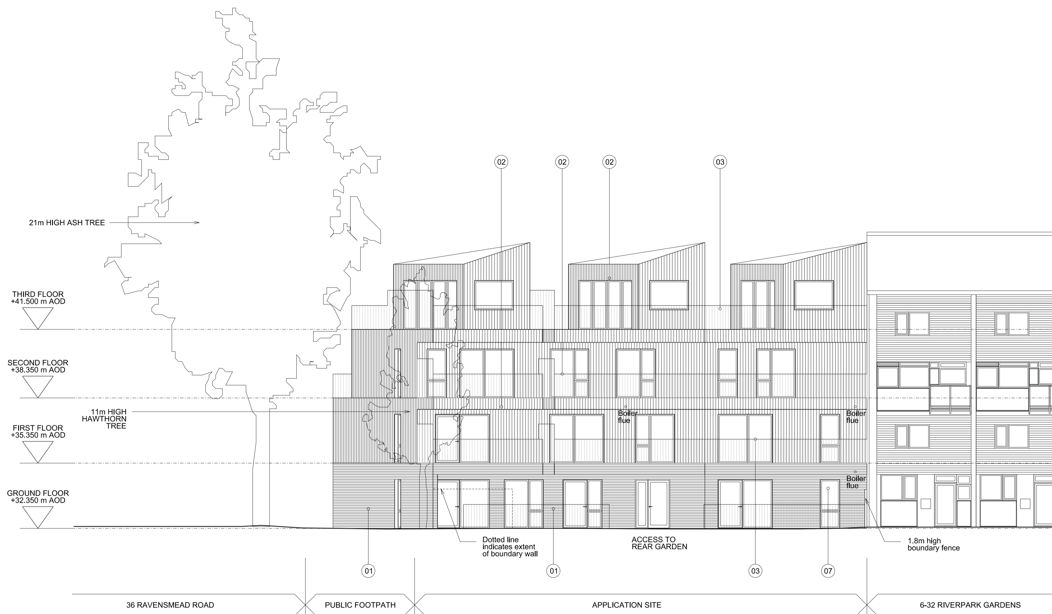
01 PROPOSED EAST ELEVATION