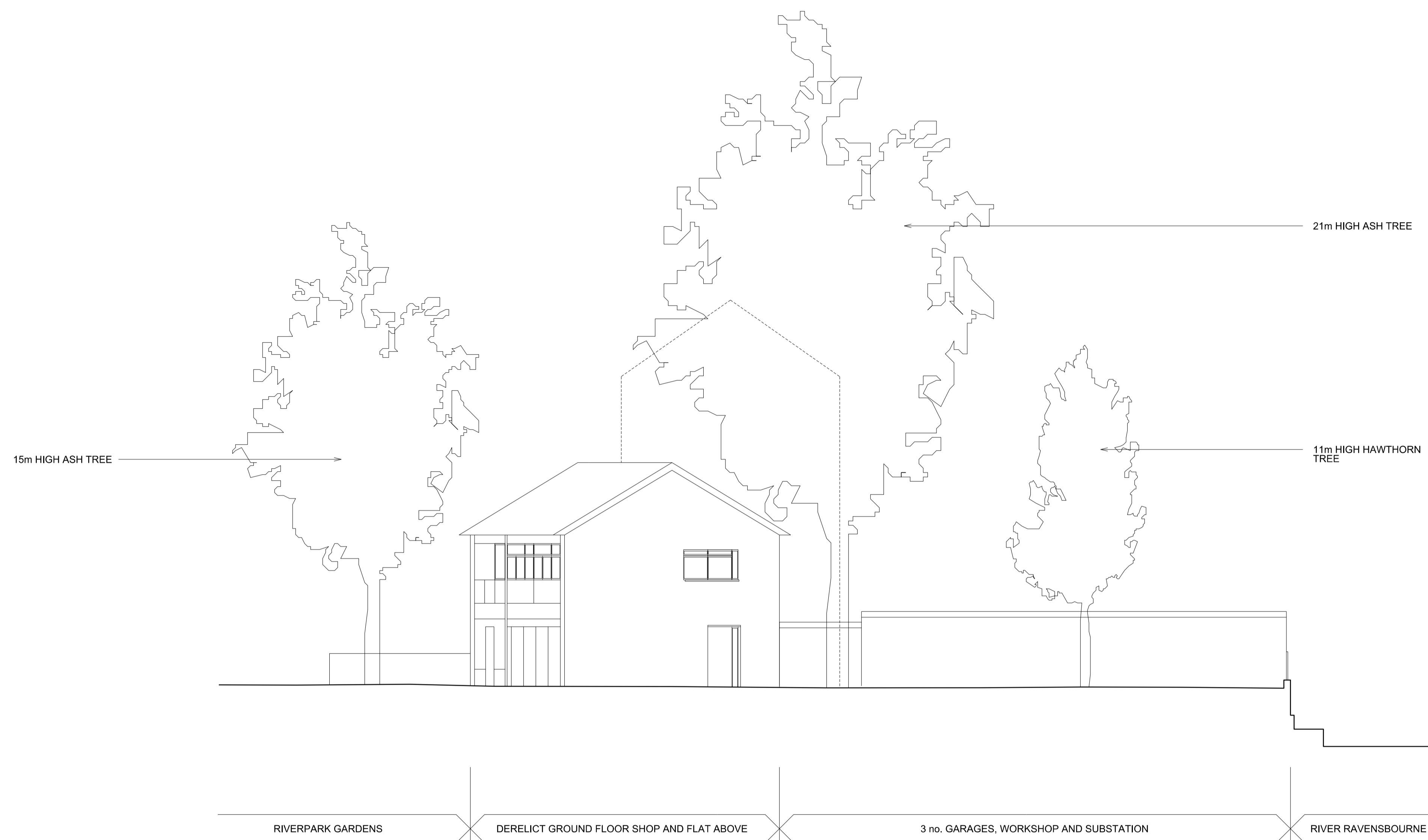
01 EXISTING SOUTH ELEVATION