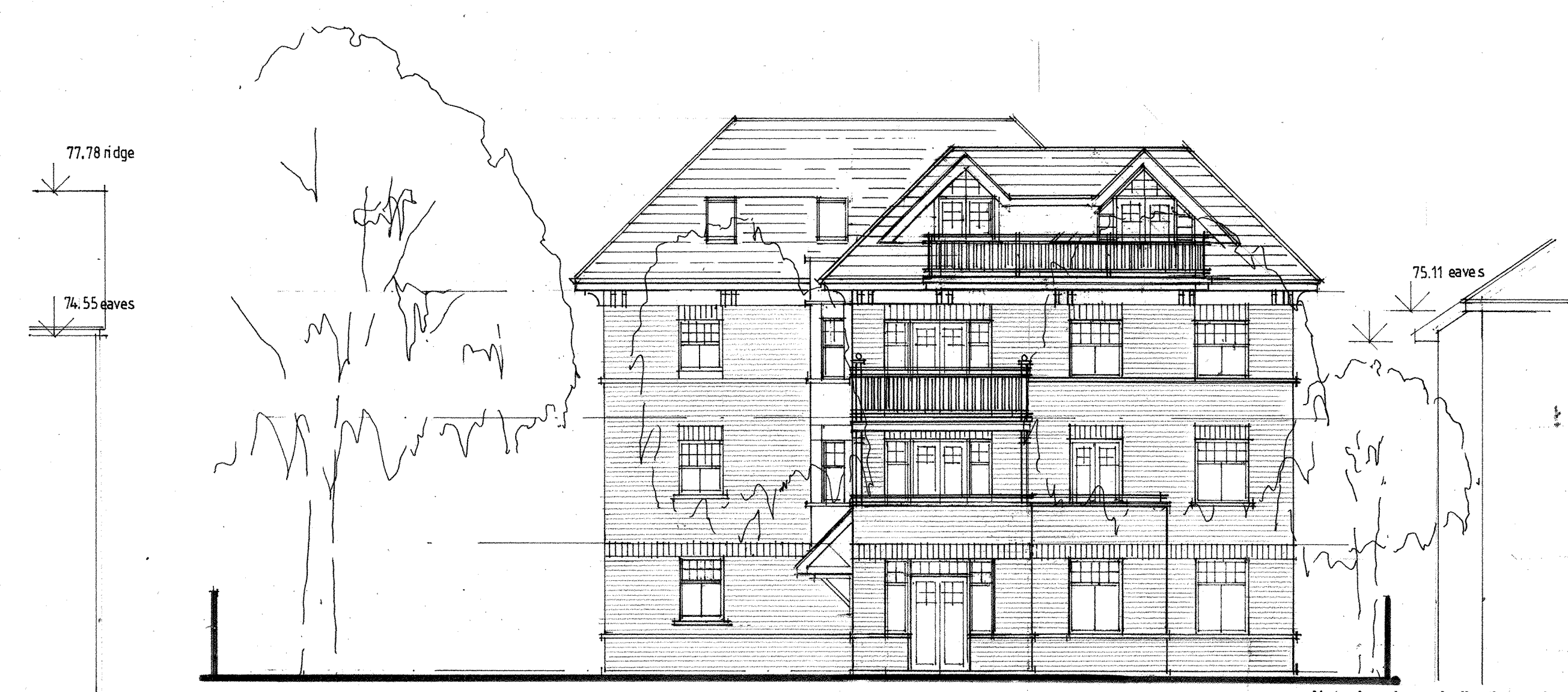
Rear (north) elevation to amenity