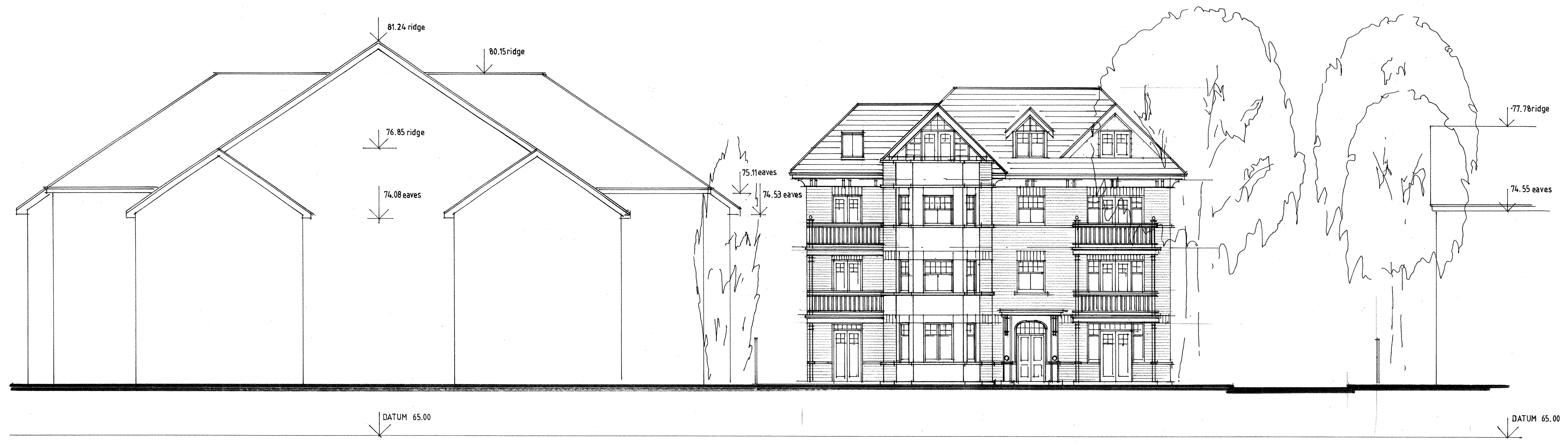
Front (south) elevation to Oaklands Road