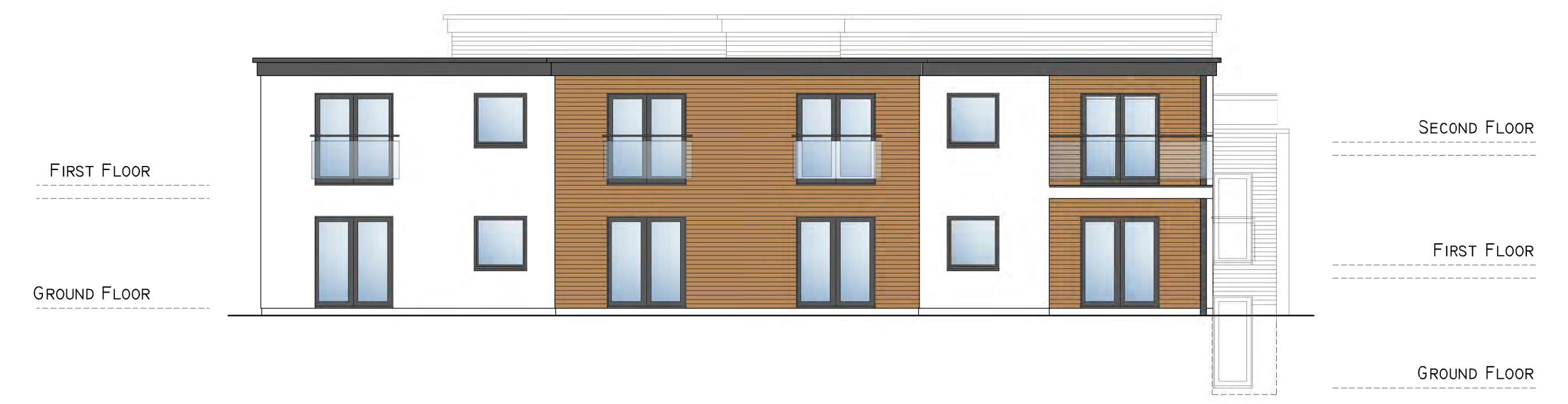
REAR (NORTH-EAST) ELEVATION