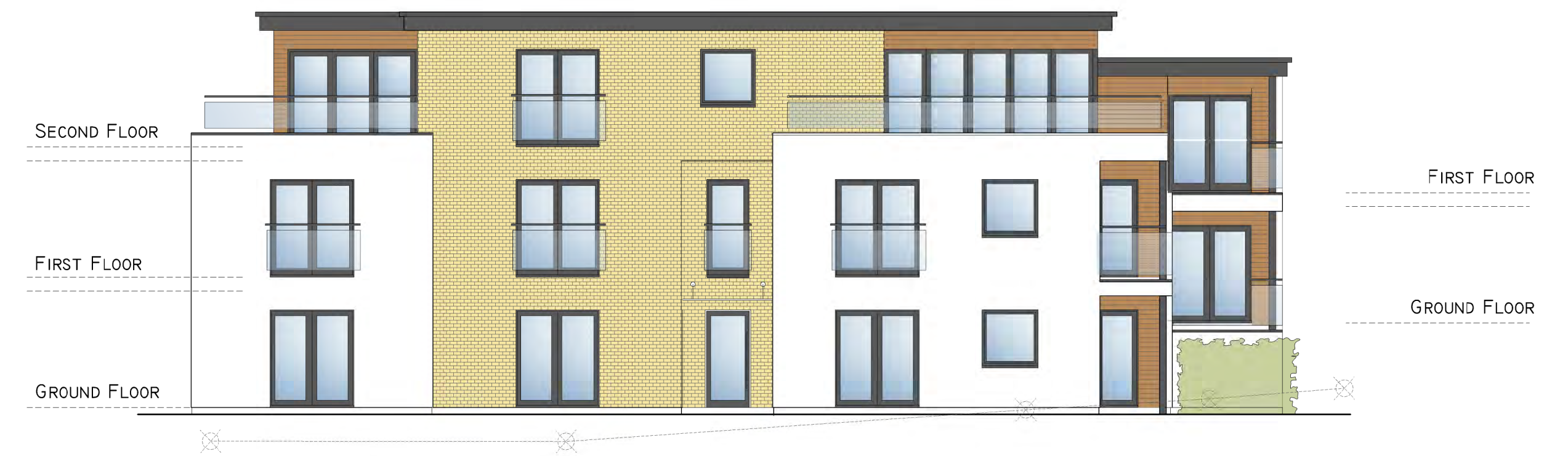
FRONT (SOUTH-WEST) ELEVATION