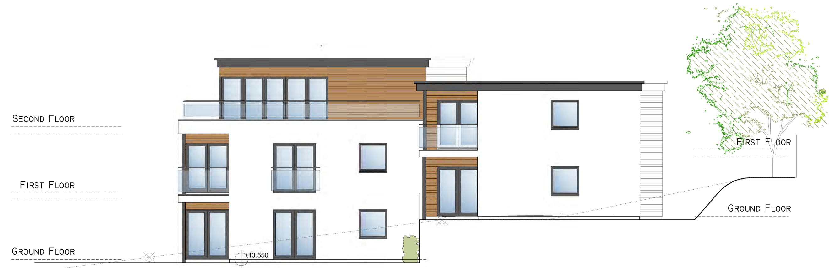
SIDE (SOUTH-EAST) ELEVATION