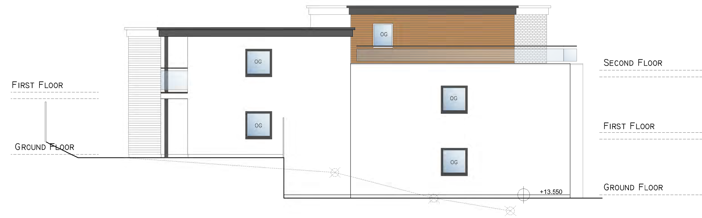
SIDE (NORTH-WEST) ELEVATION

Notes: Do Not Scale. Use only figured dimensions. All dimensions to be checked on site prior to construction. Any discrepancies to be notified to the architect. All Copyright Reserved to bhd architects.