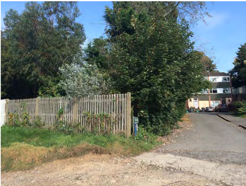
View down Tresco Close