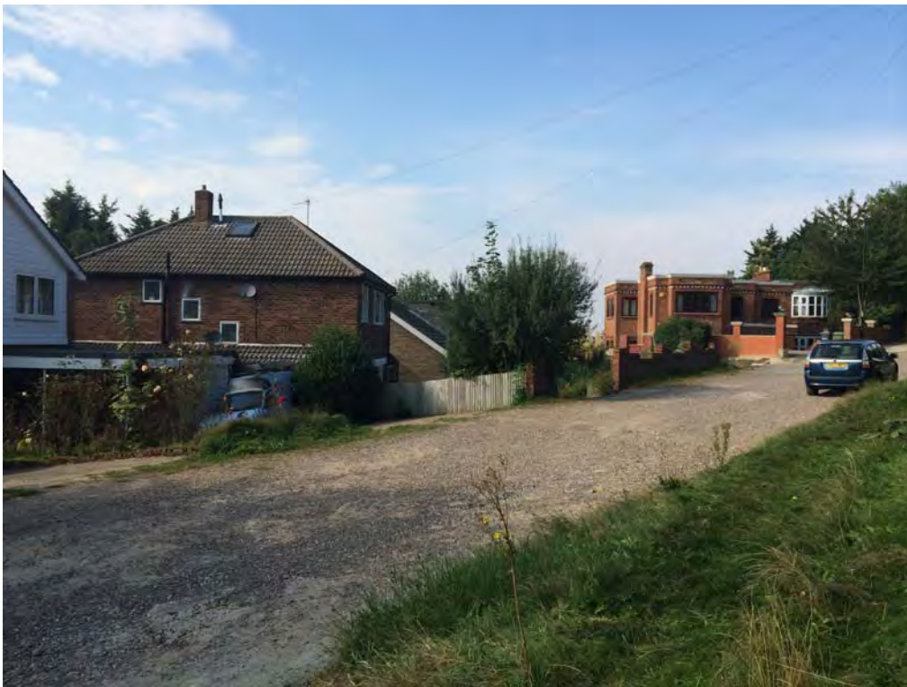
View north along Hillbrow Road