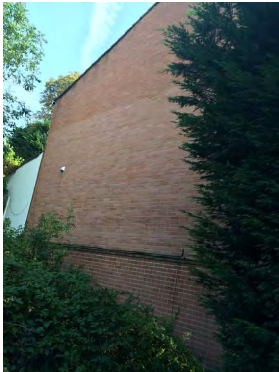
View of flank wall of no.7 Tresco Close