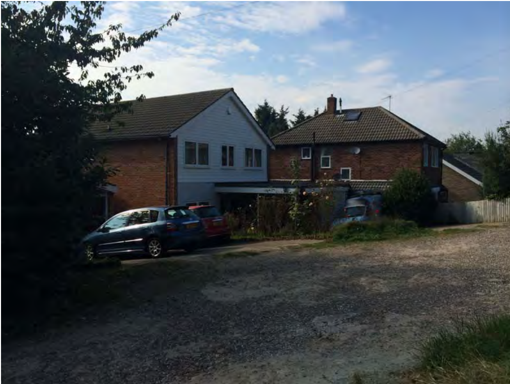
View north along Hillbrow Road