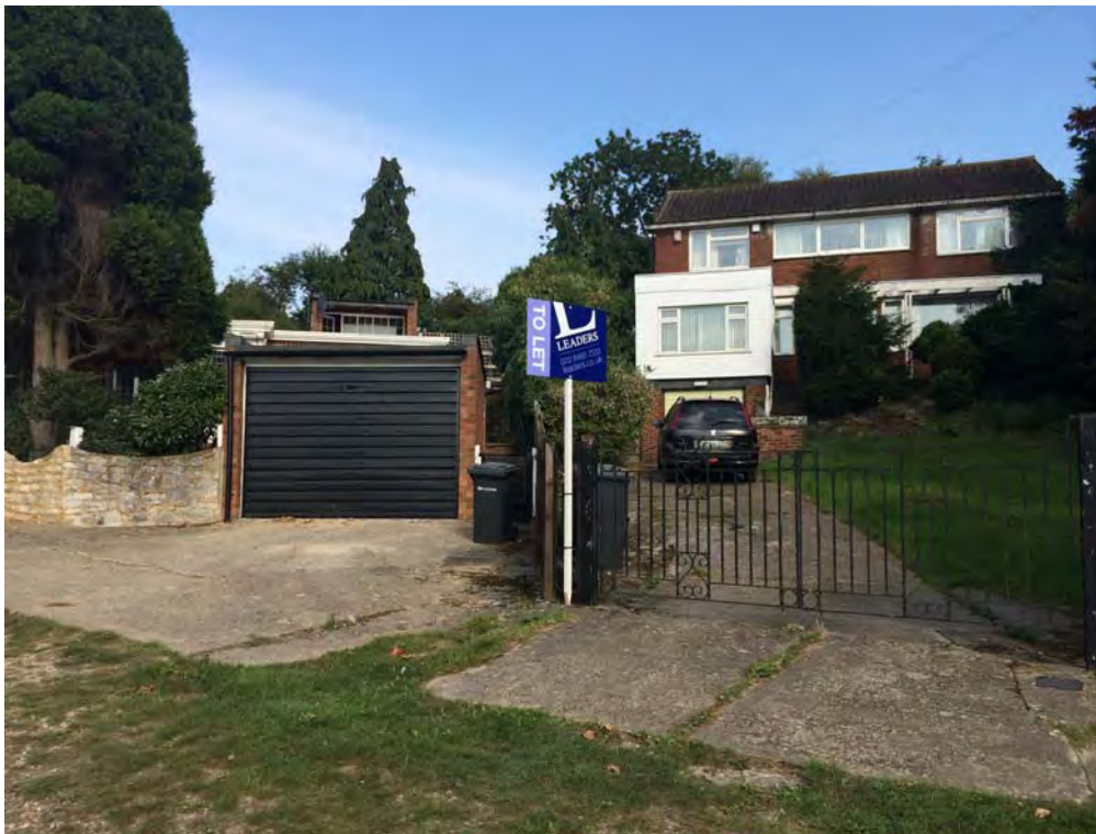
View of Upfield from Hillbrow Road