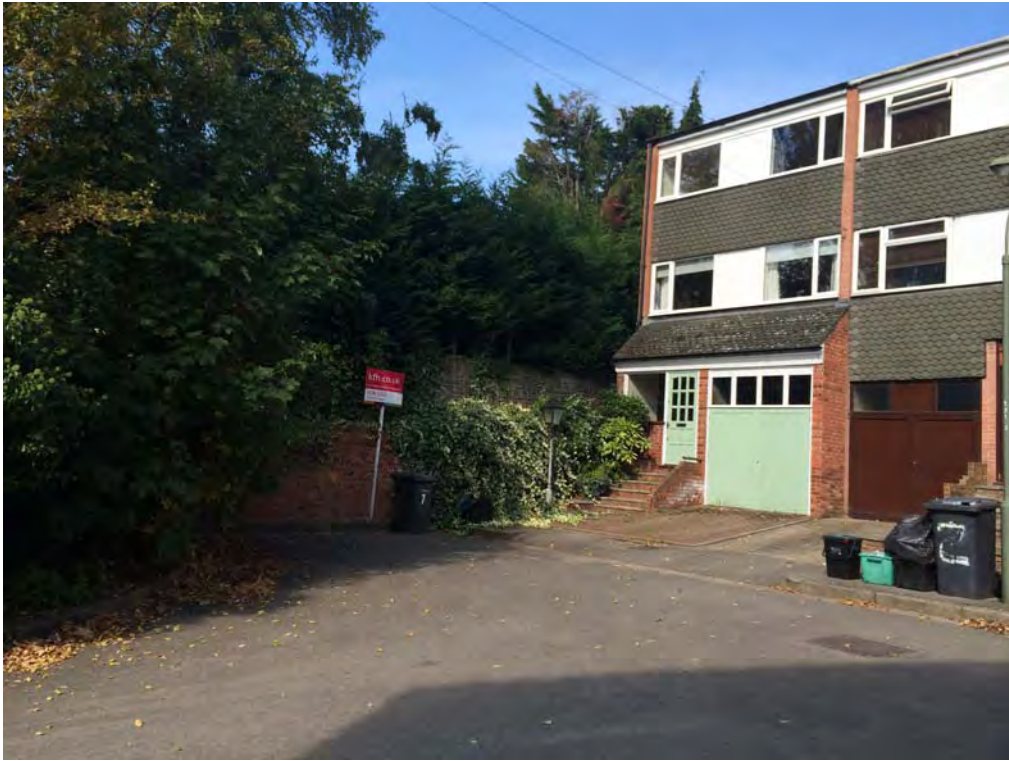
View of No. 7 Tresco Close