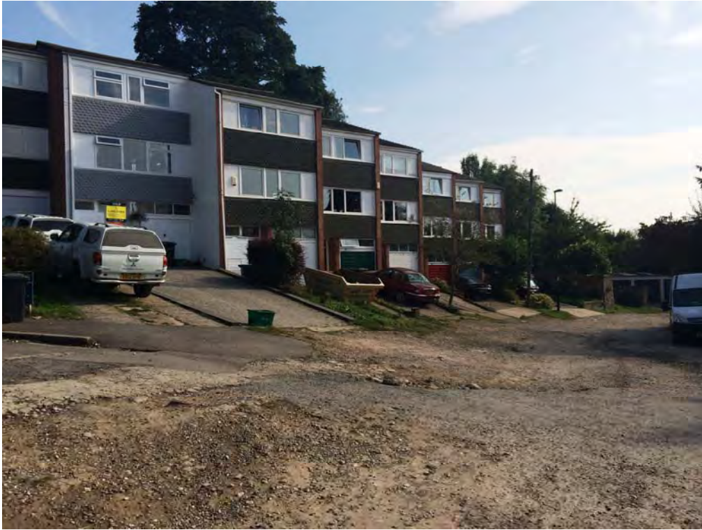
View south to town houses on Hillbrow Road