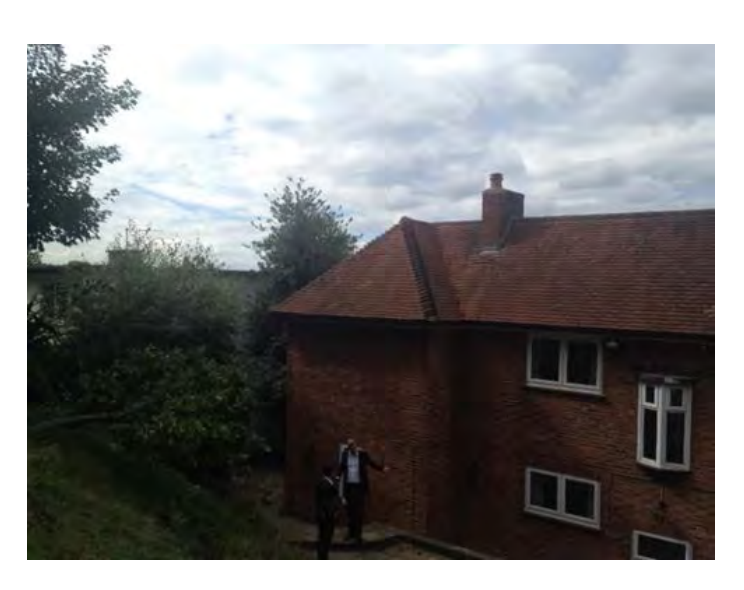
No. 98 is lower than No. 100