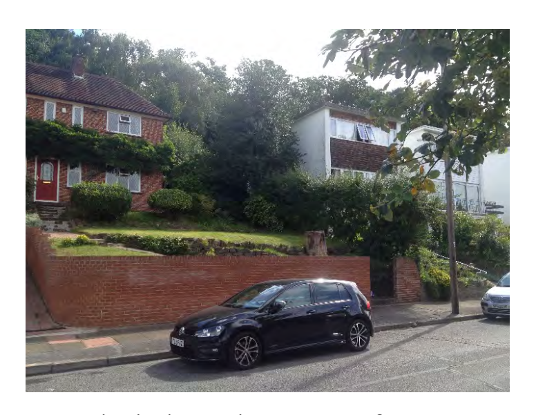
Boundary landscaping between No. 98 & No. 100