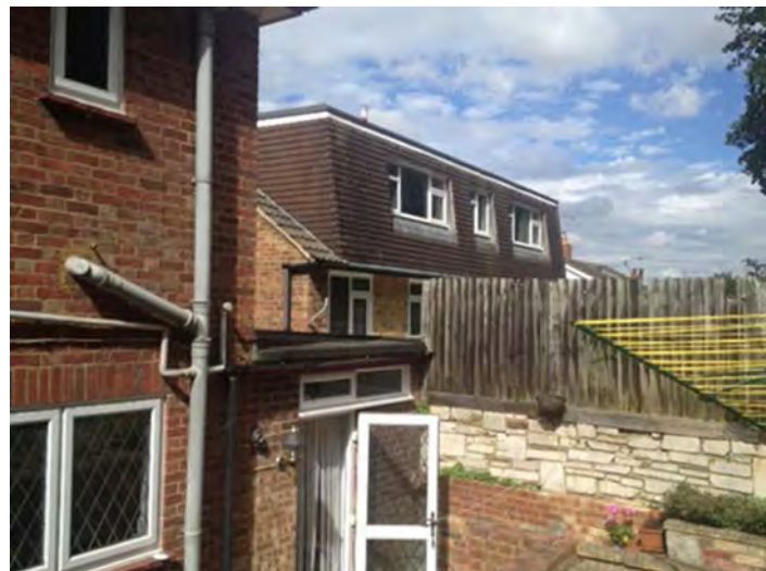
Relationship 100 & 102 at rear showing fourth storey rooms in roof of No. 102 which is lower than No. 100