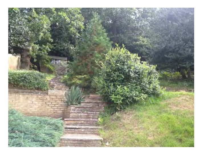
Existing tiered garden with wooded area beyond