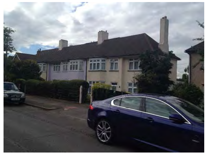
Streetscene Madeira Avenue Western side, two storey terraced housing set below the road and less variety than on the Eastern side