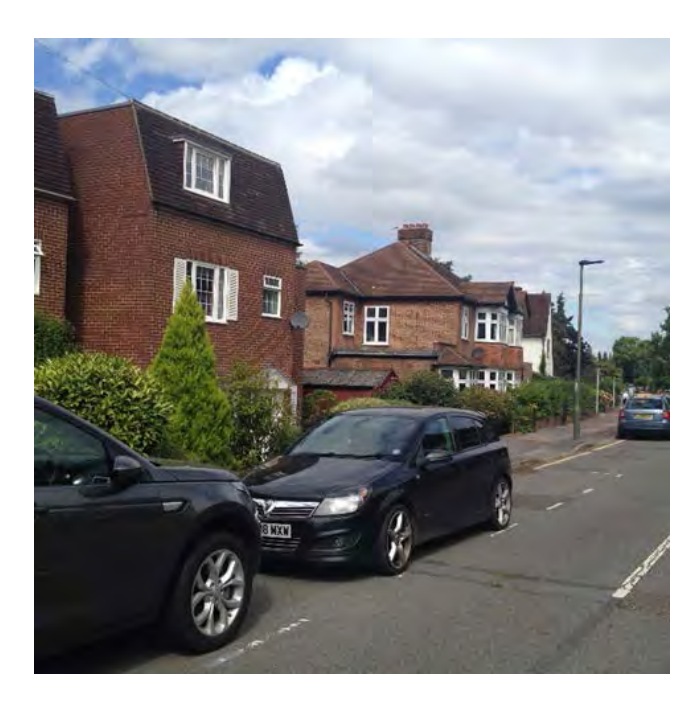
Mixed residential types and forms including 6 terraced houses at the other end of Madeira Avenue