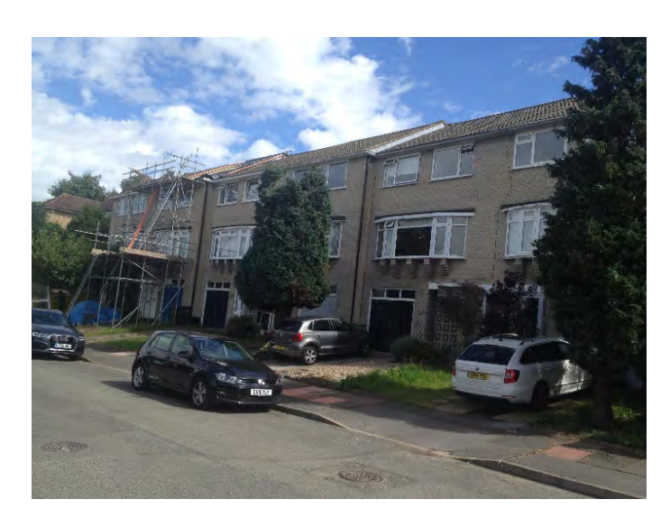
Two-storey housing adjoining a terrace of 6 three-storey town houses and side boundary landscaping further North on Madeira Avenue with the fourth floor rooms in the roof under construction at No. 122.