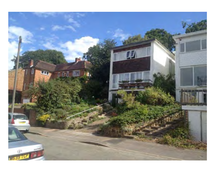
No 98 3 storey and No. 96 three storey with single garage below