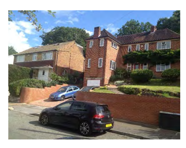
Relationship Nos. 100 and 102