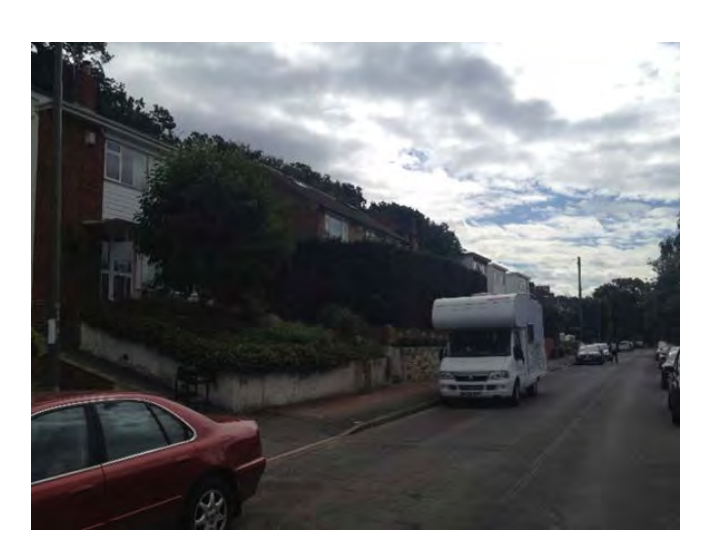
Streetscene Madeira Avenue Eastern side