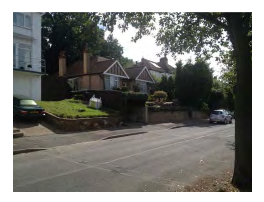
Mixed residential even includes a bungalow South of the appeal site