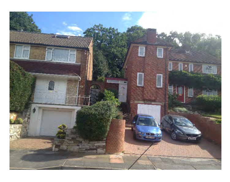
Side boundary between No. 100 and 102 which has an integral garage at street level and 3 floors of accommodation above