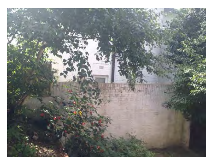
Relationship Nos. 98 and 100 at rear